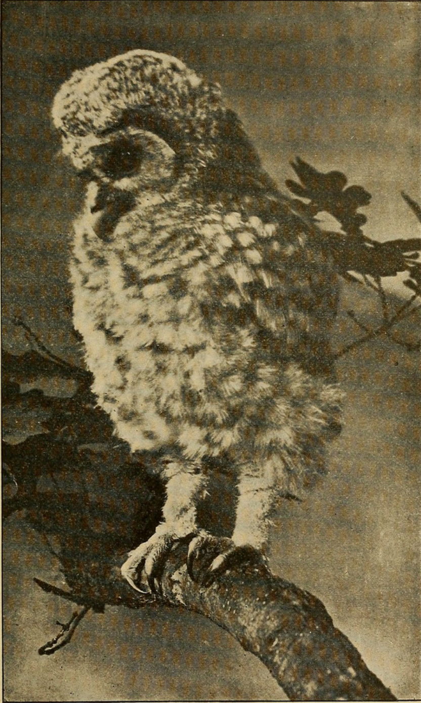
Fig. 2. Young Barred Owl.