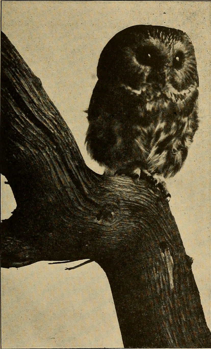
Fig. 1. Saw-whet Owl.