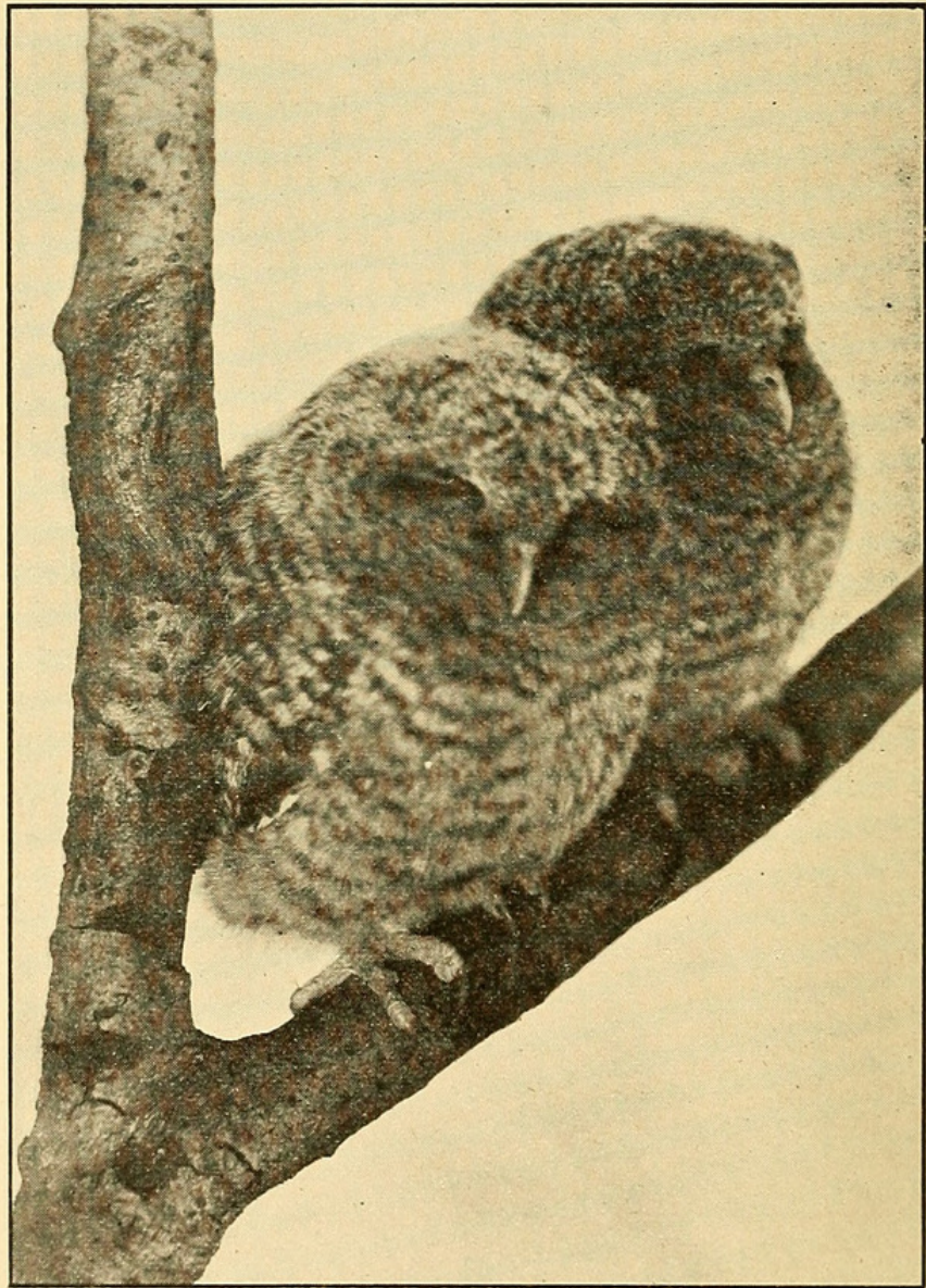
Fig. 5. Young Screech Owl.

hold the Barred owl up for, and in these days they probably do not kill as many young chickens as they did when Audubon lived, and whose observations, by the way, were largely confined to Louisiana, where, so far as my experience car-