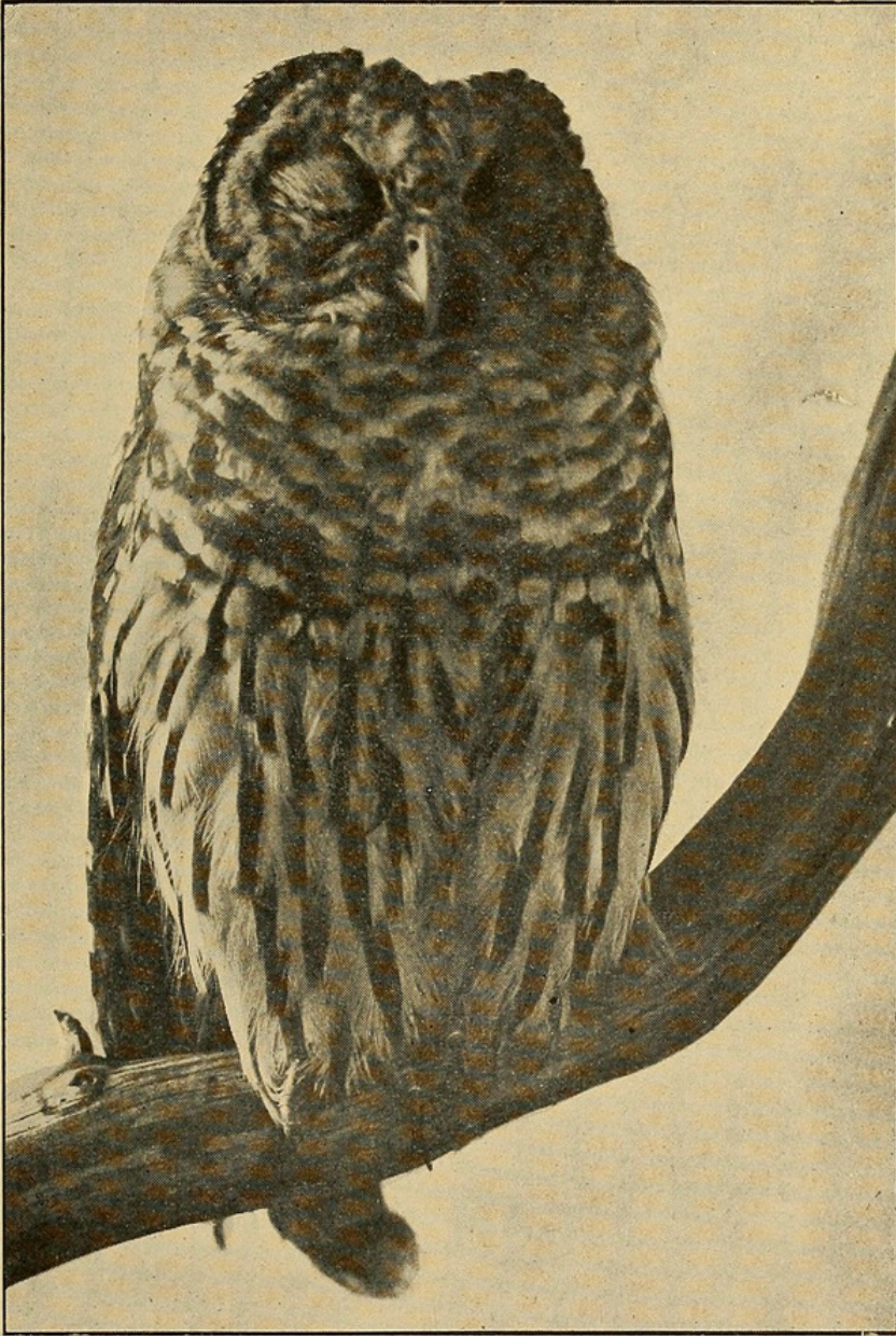
Fig. 2. Subadult Barred Owl.

Most of the stories, as they have come down to us through the generations, have arisen among the farmers in those sections of the country where such barn-yard fowls as turkeys and chickens, not having been supplied with shelter, have