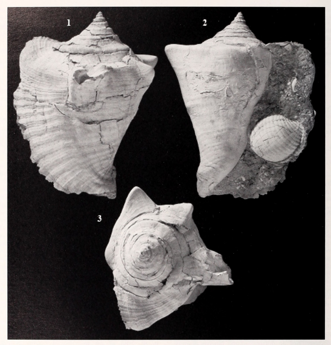
Figures 1–3. Lobatus vokesae Landau, Kronenberg and Herbert sp. nov. Holotype, NHMW 2007z0161/0001. Locality: Rio Cana, area equivalent to NMB 16832/16833 and TU 1230, Cercado Formation (late Miocene) (Saunders et al., 1986, text-figure 15). Length 220 mm; dorso-ventral height (restored) 165 mm; width 190 mm.

2007). Lobatus gigas has not been found in the Dominican Republic assemblages.