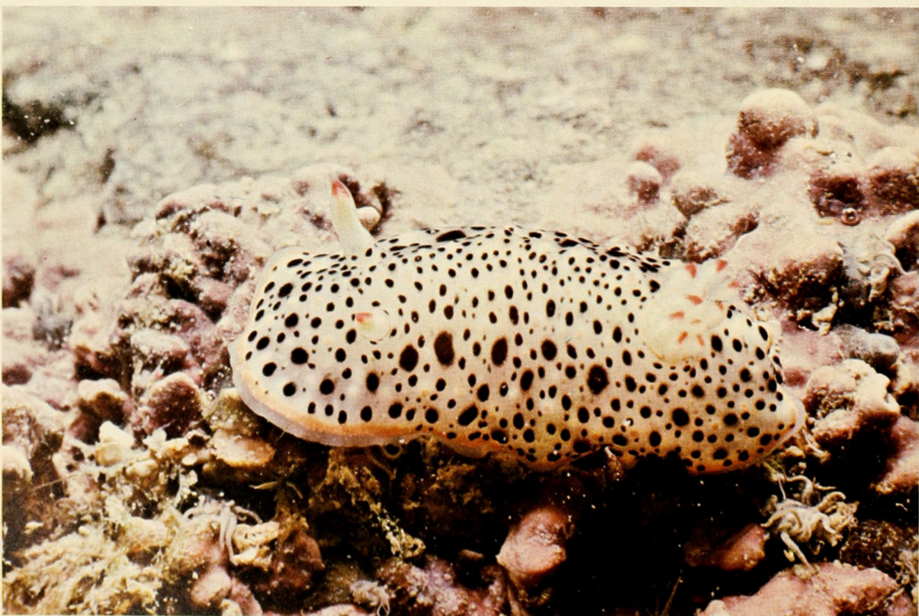
PLATE 1b. Chromodoris banksi from Puertecitos, Baja California, Mexico.