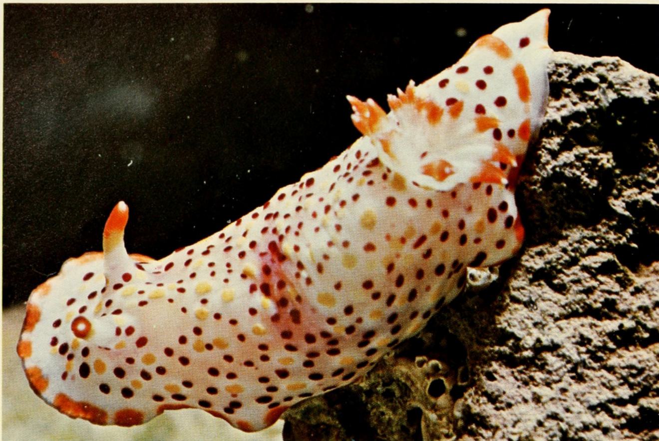
PLATE 1a. Chromodoris norrisi from Cerralvo Island, Baja California, Mexico.