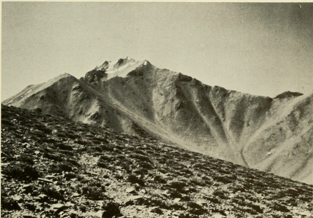
Fig. 2. Alpine Biome. Foreground with typical mat vegetation. Esmeralda County: Summit of Boundary Peak in background.

In all zones of all three subdivisions mountain streams are bordered by aspen,