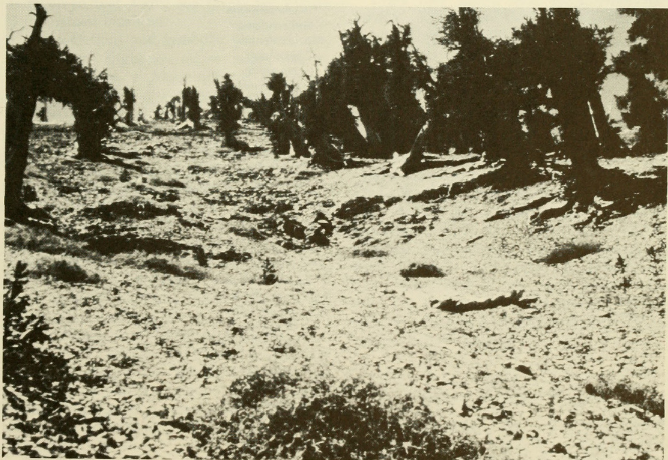
Fig. 4. Ecotone between Alpine and Coniferous Forest biomes. Open stand of bristlecone pines. Clark County: Charleston Peak, Spring Mountains.

Table 1 shows that our montane ants are a relatively unspecialized lot. Myrmica comes first on everybody's list of Myrmicinae and Manica is second. Stenamma and Aphaenogaster are not far above them. But