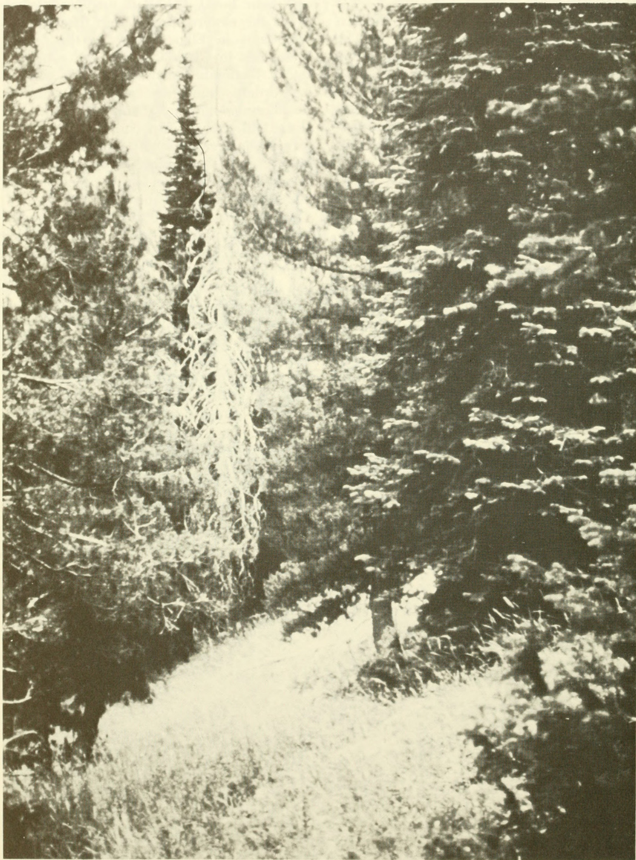
Fig. 3. Coniferous Forest Biome. Elko County: Snowslide Gulch, Jarbidge Mountains.