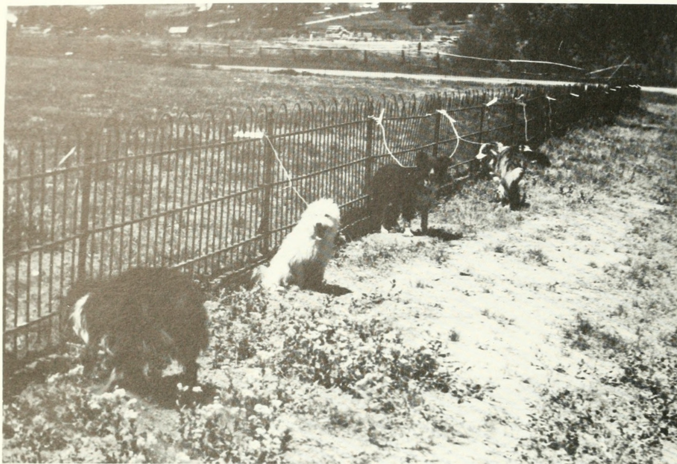
Fig. 3. Sheep dogs from Sanpete County restrained at field clinic during examination for detection of Echinococcus granulosus tapeworms.

of these control measures, the number of dogs found infected at the field clinics has decreased from 27 percent in 1971 (Loveless et al. 1978) to 14 percent in 1978 (unpublished ms.). Most sheep ranchers have shown a cooperative attitude with regard to proper disposal of sheep carcasses or viscera. Certain individuals, however, have not been successful in preventing reinfection of their dogs as evidenced by the fact that some of their dogs were found repeatedly infected on numerous occasions. We believed that if the reasons could be determined why some dog owners were unable or unwilling to comply with the recommended preventive measures, it might be possible to change or modify the recommendations to obtain more cooperation, and ultimately an improved control program.