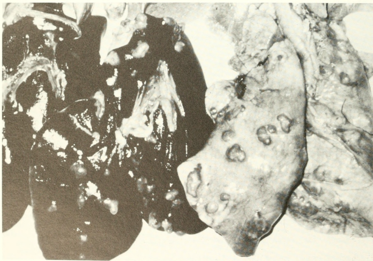
Fig. 1. Fluid-filled hydatid cysts in the livers and lungs of infected sheep.

or other organs (Fig. 1). The cysts are the larval (immature) forms of a tapeworm parasite, Echinococcus granulosus (Fig. 2), which lives