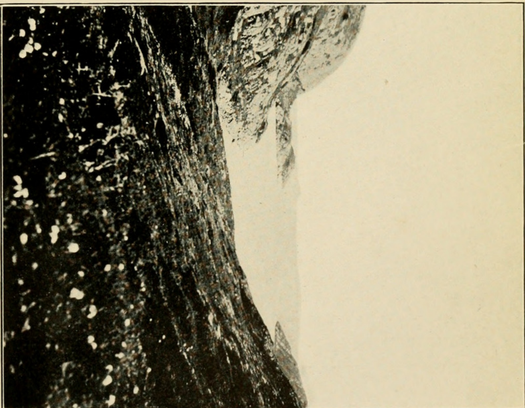
2. HARE HARBOR, AUDUBON'S "BOWL," LITTLE MECATTINA ISLAND.