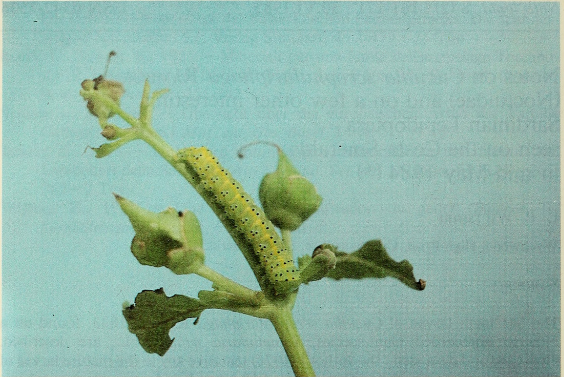
Fig. A. Lightly-marked immature larva on Scrophularia trifoliata .