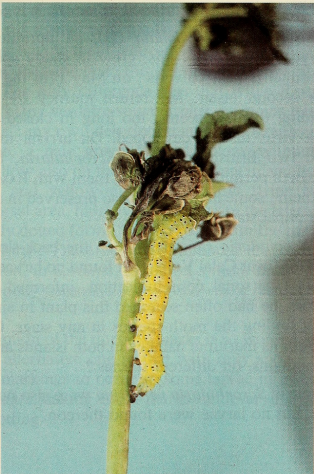
Fig. D. Lightly-marked, nearly mature larva (lateral aspect) on S. nodosa .