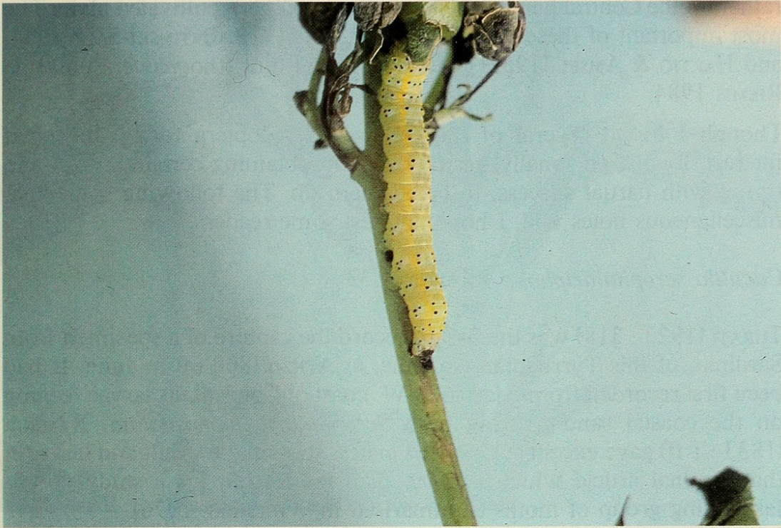
Fig. C. Lightly-marked nearly mature larva (3/4 aspect) on S. nodosa .