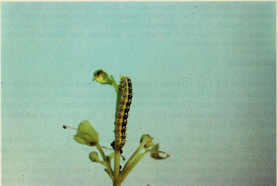
Fig. B. Strongly-marked immature larva on S. trifoliata .

Figs. A-E : Larvae and foodplants of Cucullia scrophulariphaga RAMBUR.