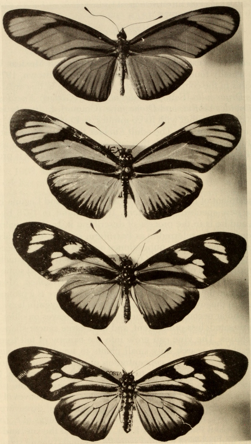
FIG. 1. Adults, top to bottom: Eueides aliphera , E. lineata , E. vibilia (male), E. vibilia (female).