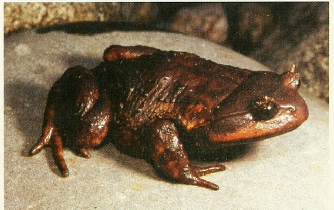
FIGURE 1. Brachytarsophrys feae , Northern Myanmar.

The males of Brachytarsophrys feae (Fig. 1) were found in evergreen montane forest at an elevation of 1,085 m. All individuals were found under rock overhangs which formed small caves in the middle of shallow slow flowing streams. In all instances, the opening to the cave faced downstream, and the substrate was gravel or cobble. Individuals were found in regions where the stream was densely covered by canopy. The stream width was about 1.5 meters, and the banks were heavily vegetated. Five males were heard calling at one locality near Ngar War Village, Hkakabo Razi National Park, Kachin State, Myanmar (27°50'03.5"N, 97°45'40.8"E). The call of one individual (SVL 116.2 mm) was recorded at 2145 hrs. during