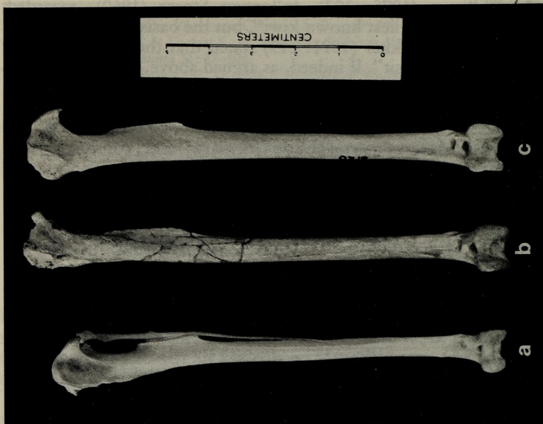
Figure 2. Left tibiotarsi of (a) Heterolocha acutirostris NMNZ 15087; (b) " H. acutirostris " BMNH 32171 = Palaeocorax moriorum ; (c) P. moriorum AU 6120.