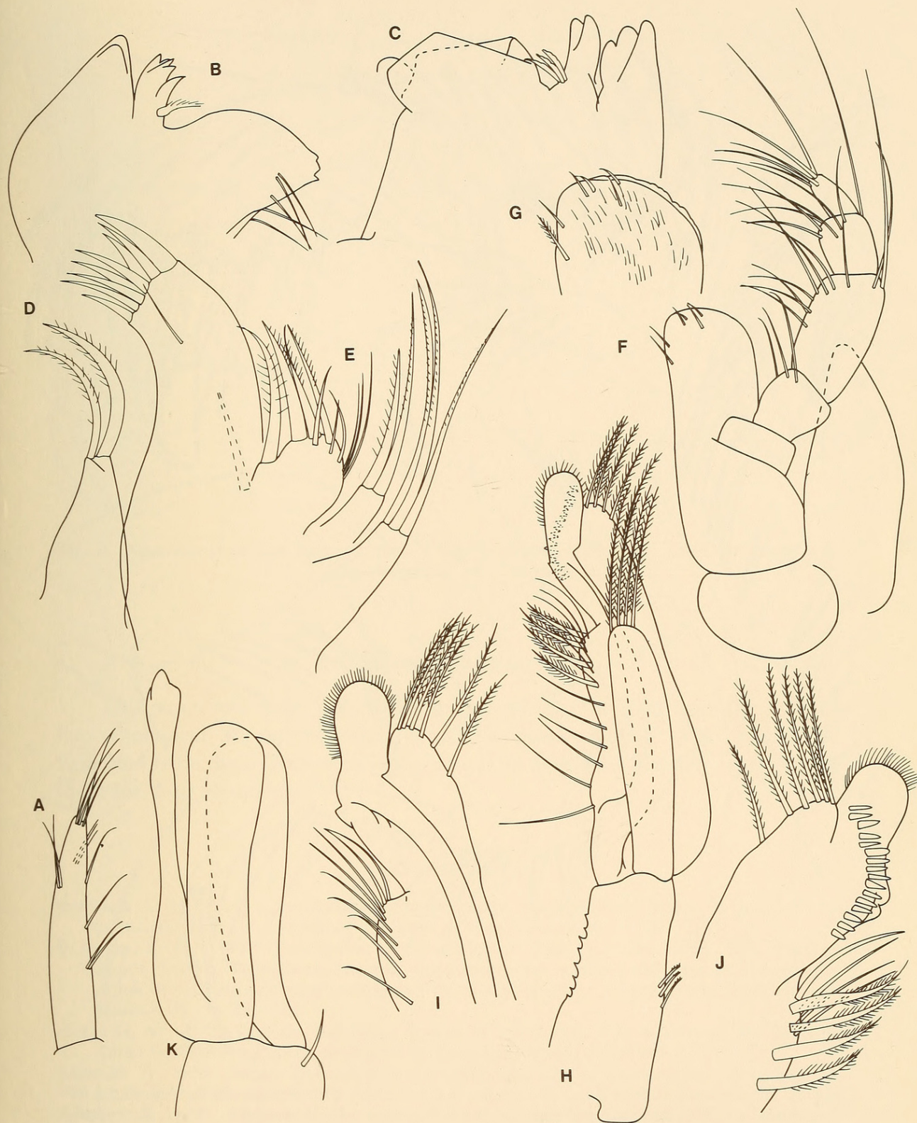
Fig. 1. Neoarcturus oudops Barnard, male holotype (from Barnard's slides which are not clear). A. Last two articles of antenna 1. B-C. Left and right mandibles. D-E. Maxillae 1, 2. F. Left maxilliped. G. Left maxillipedal endite. H. Right pleopod 1, posterior view. I-J. Apex of endopod of pleopod 1, posterior and anterior views. K. Pleopod 2 (no setae shown).