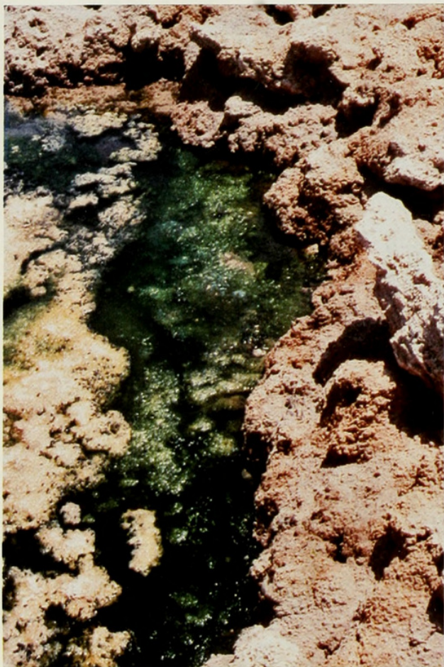
Fig. 3. Typical breeding site of Anopheles (Celia) ainshamsi near Râs Shukeir on the Gulf of Suez coast.

detritus (Haliday) also occur in these habitats. The type series consists of larvae and specimens reared from larvae and pupae collected from salt encrusted pools and drilled holes ranging from 0.2–2.0 m in diameter. A typical saline pool inhabited by larvae is shown in Fig. 3.