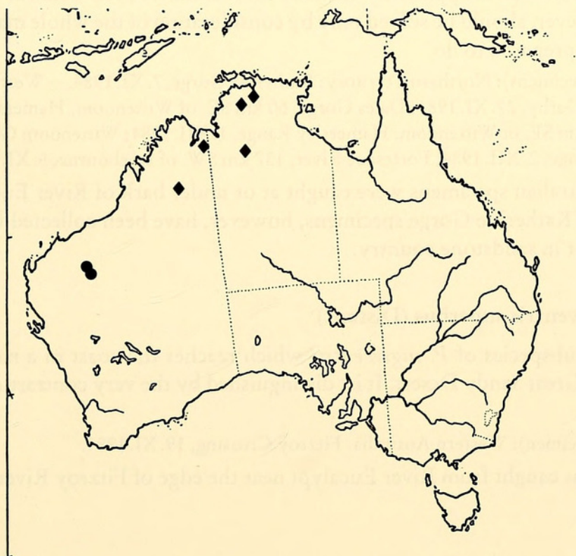
Fig. 3. Distribution of Poecilometis vallicola spec. nov.: ● and of Poecilometis mimicus (Distant): ◆.

Another rather common species which is widespread in northern parts of Australia. The material mentioned below shows remarkable variability of size, pattern, and colour.