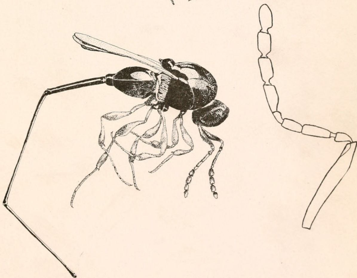
DOLICHOTYPES HOPKINSI, NEW SPECIES.