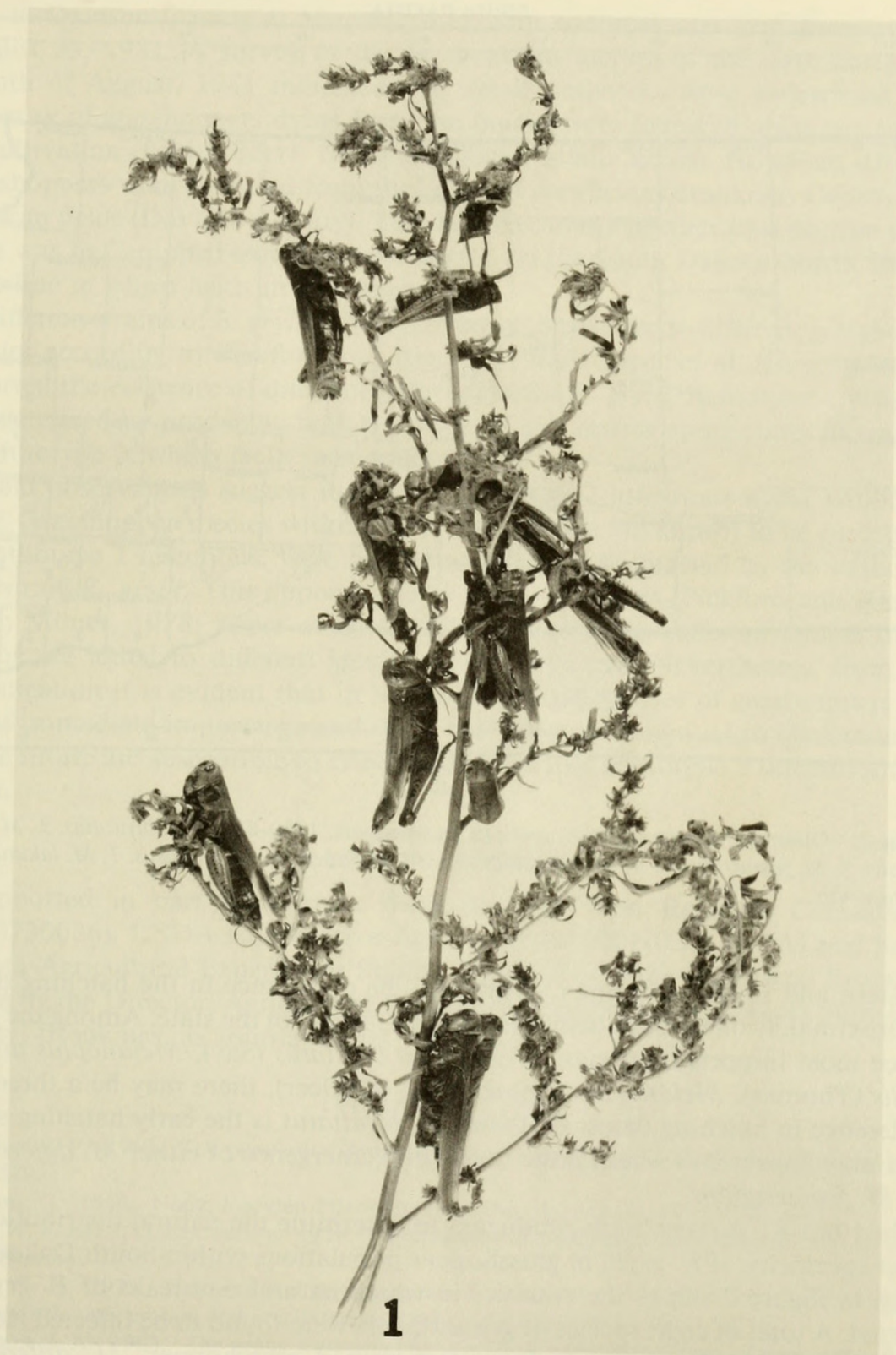
Fig. 1. Fungus-killed grasshoppers clinging to vegetation.

often curls upward and forwards, in some cases touches the pronotum (Schaefer, 1936). In material observed in South Dakota, this curling was most often found to be associated with nymphal stages. In most specimens killed by the fungus the body becomes very hard and is filled with resting spores.