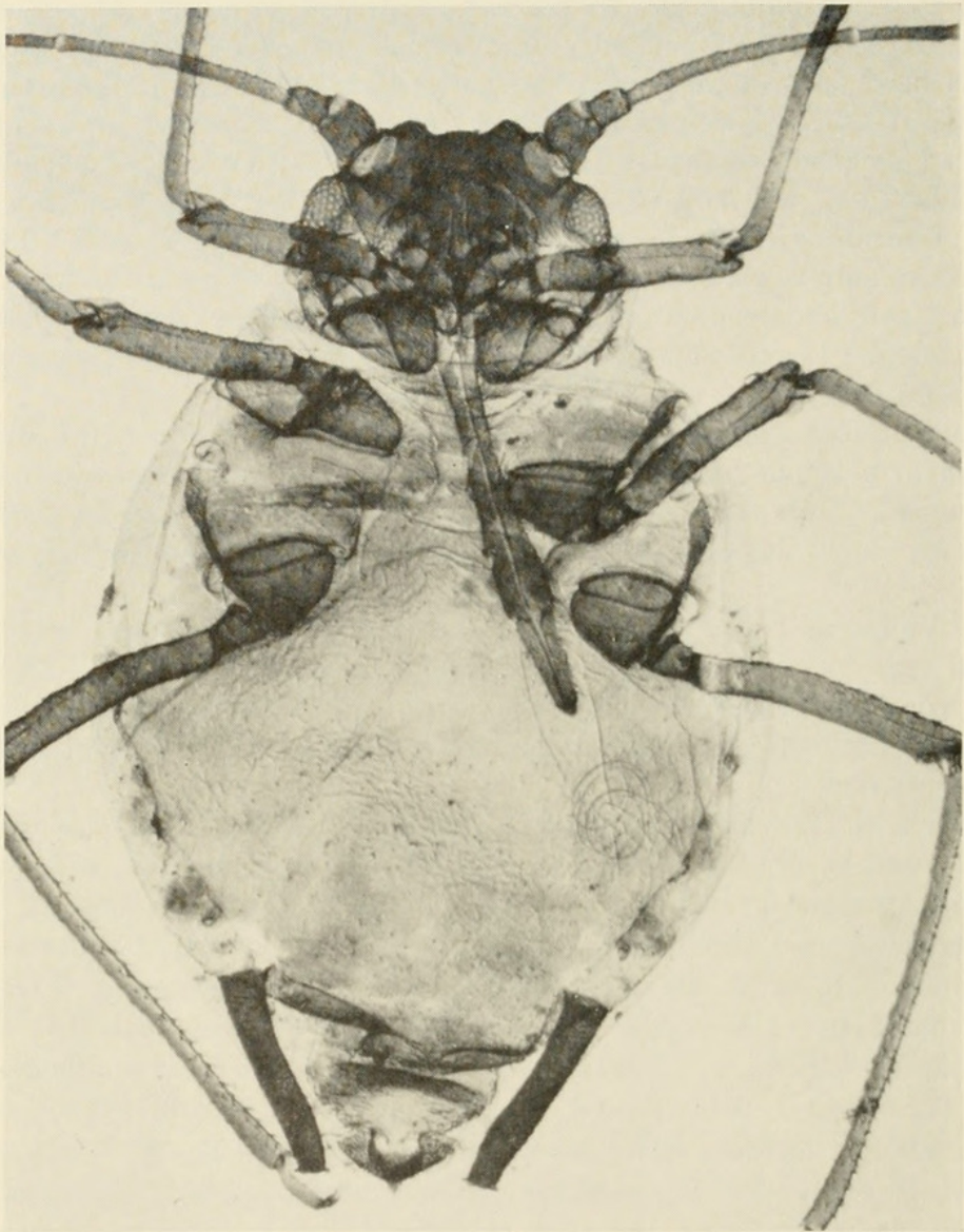
Fig. 2. Myzodium modestum (Hottes), apterous vivipara.

No. 74-52, and 5 slides, Coll. 74-53, G. F. Knowlton and C. F. Smith Coll.).