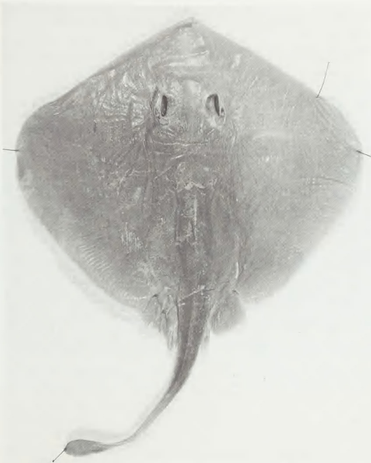
Figure 6. Urolophus westraliensis , holotype, CSIRO CA2870.