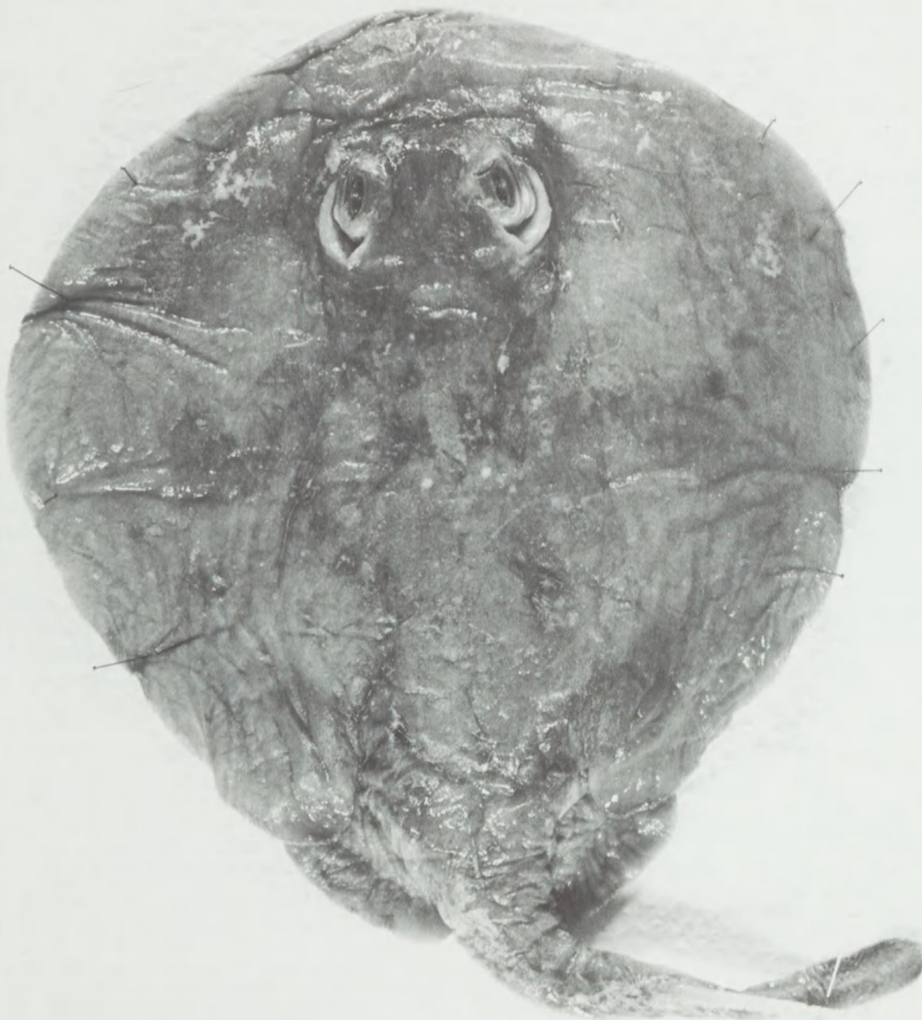
Figure 3. Urolophus orarius , holotype, AMS I.20194-043.

lobe. Posterolateral border of nostril forming weak nob, not forming broad flattened lobe. Tail rounded in cross-section; moderately elongate (72-80% disc length); lateral cutaneous folds and