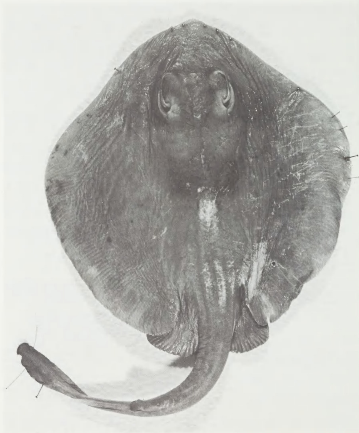
Figure 2. Trygonoptera personata , holotype, CSIRO H46.