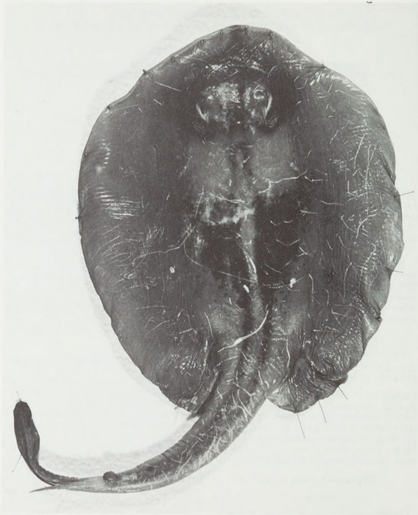
Figure 1. Trygonoptera ovalis , holotype, CSIRO CA521.