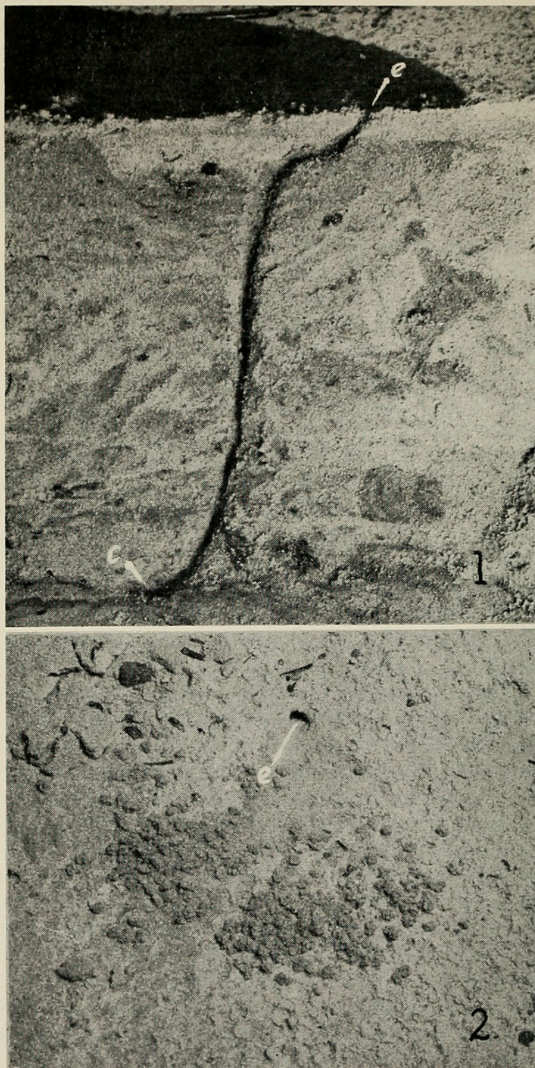
PLATE I. Tachytes mergus Fox. Fig. 1, burrow profile ( c , cell; e , entrance), nest 63062 B, July 1962, \times 0.54 . Fig. 2, burrow entrance ( e ) and excavated sand pellets, nest TY-4, 2 July 1962, \times 0.50 . (Both figures by KVK.)