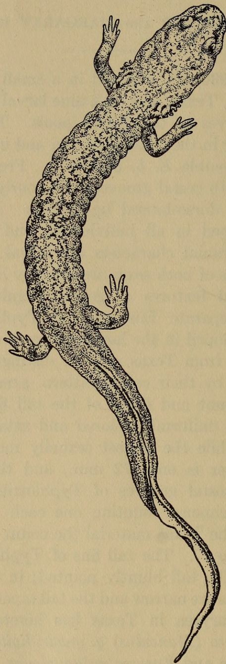
Eurycea neotemes , n. sp. Male, actual length 72 mm. Drawn by Miss M. L. Leffler.

This is a small, slender species attaining a maximum length, in this series of specimens, of 72 mm. Head moderately broad, widest immediately anterior to the gills; snout bluntly rounded; gills with long rami; costal