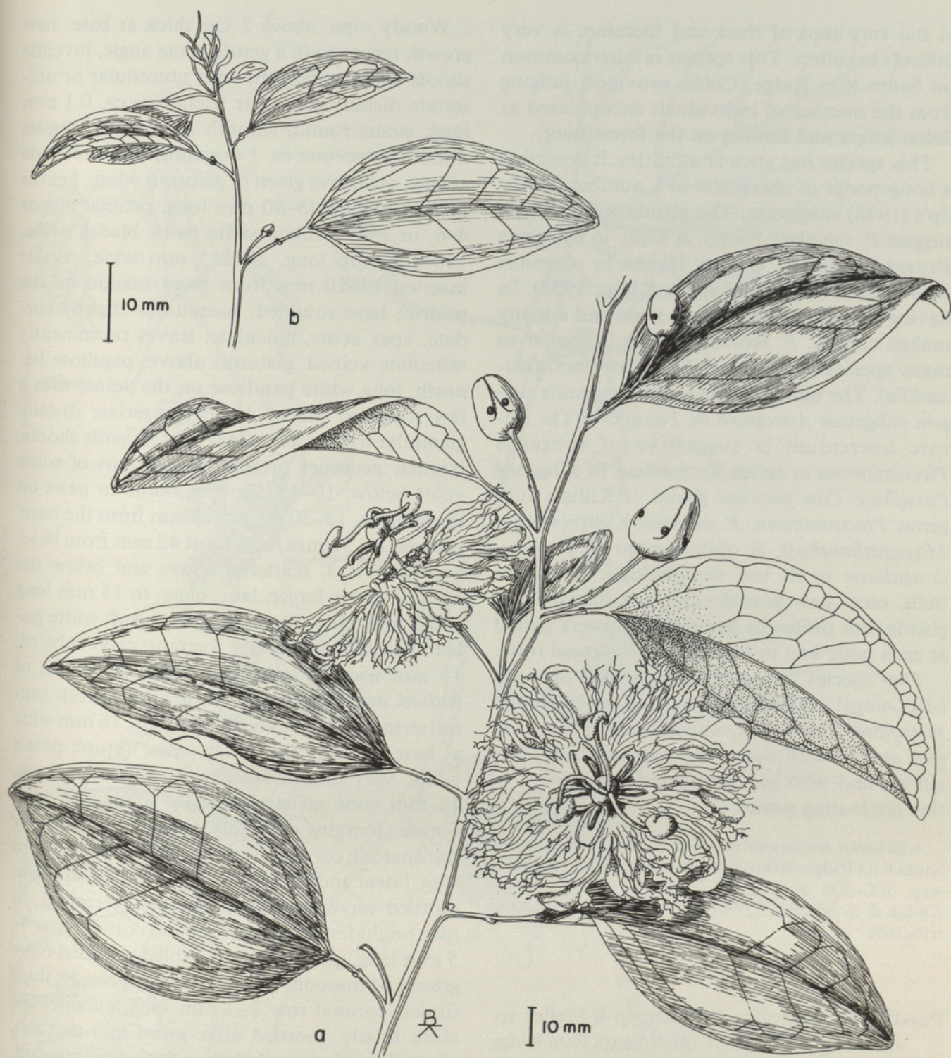
FIGURE 1. Passiflora macdougaliana .—a. Habit.—b. New growth (from Knapp, Mallet & Huft 4587).

followed by a filamentous row ca. 3 mm long; innermost 2 coronal rows 2 mm long, stiff and upright; operculum plicate, ca. 5 mm long, white, the upper surface incurved and covering the limen; floral nectary arising just inside the base of the operculum, nectar secreting area a trough ca. 4 mm deep, 2 mm wide, lined with a yellow pad; limen red, arising from inner edge of the trough, 1 mm high, covered by the tip of the operculum; androgynophore ca. 7 mm long from base to filament origin, white, from above slightly asym-