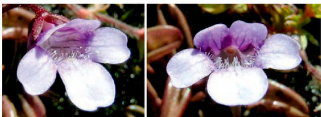
Figure 5: Pinguicula involuta . Inca trail Peru. Short-stalked flower in midst of a dense cluster of star-like leaves (its margins heavily curled up).