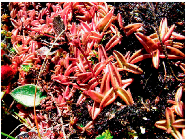
Figure 4: Pinguicula involuta . Inca Trail Peru. Cluster of star-like leaf rosettes. A single elongated and erect fruiting scape (center) is visible. Apart from the fruiting scape, such a living individual could have been the pattern of Pulgar’s portrait of Pinguicula stellata . Photograph: F. Rivadavia, with permission.

Rubio’s isolated single specimen of plate XXXI is not the product of true-to-life drawing, it is the result of combination of various sources available to him. But is it mainly the result of elaboration on his part? Or is it the result of the addition of elements (perhaps imagined) by a number of artists and botanists? 10 It may be that Ruiz favored the final single-specimen-version against the original cluster-version to bring the picture in line with the other plant portraits of the Flora Peruviana.