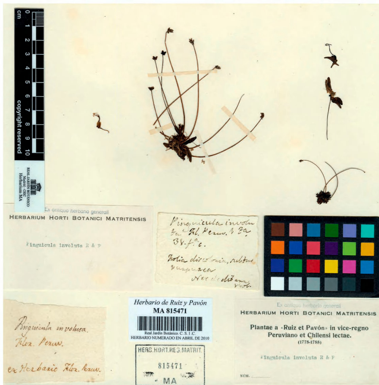
Figure 2: Pinguicula involuta , lectotype MA 815471. In the plate center the unusual specimen(s) with eight long stalks, some fruitless. This is presumably the source material for Rubio's drawing. Photocopy reproduced with permission

Following Dominguez et al. (2017:185) it is likely that as J. Rubio prepared the painting of Pinguicula involuta (Ruiz & Pavón 1798a: lam. XXXI, fig. c), he had in his hands the specimens of MA 815471. This specimen is unusual because of the large number of scapes developed on a presumably solitary Pinguicula rosette (see Fig. 2). This specimen bears eight leafless scapes curving upwards, none with flowers and fruits, but with seven retaining calyxes. J. Rubio's drawing shows also eight scapes, four flowering and four fruiting, the latter shorter than the flowering ones (see Fig. 1). Apparently during the making of the plate, the draftsman supplemented the specimen with flowers and fruits missing on the voucher. He might have used the single flower that is conserved on specimen MA 815471 as his model, however, did he do so? In spite of the apparent similarity of the drawing to the specimen on MA 815471 some problems remain. First, the flowers are drawn too beautifully, and do not correspond with preserved specimens. Second, the spurs are drawn sickle-shaped, unlike