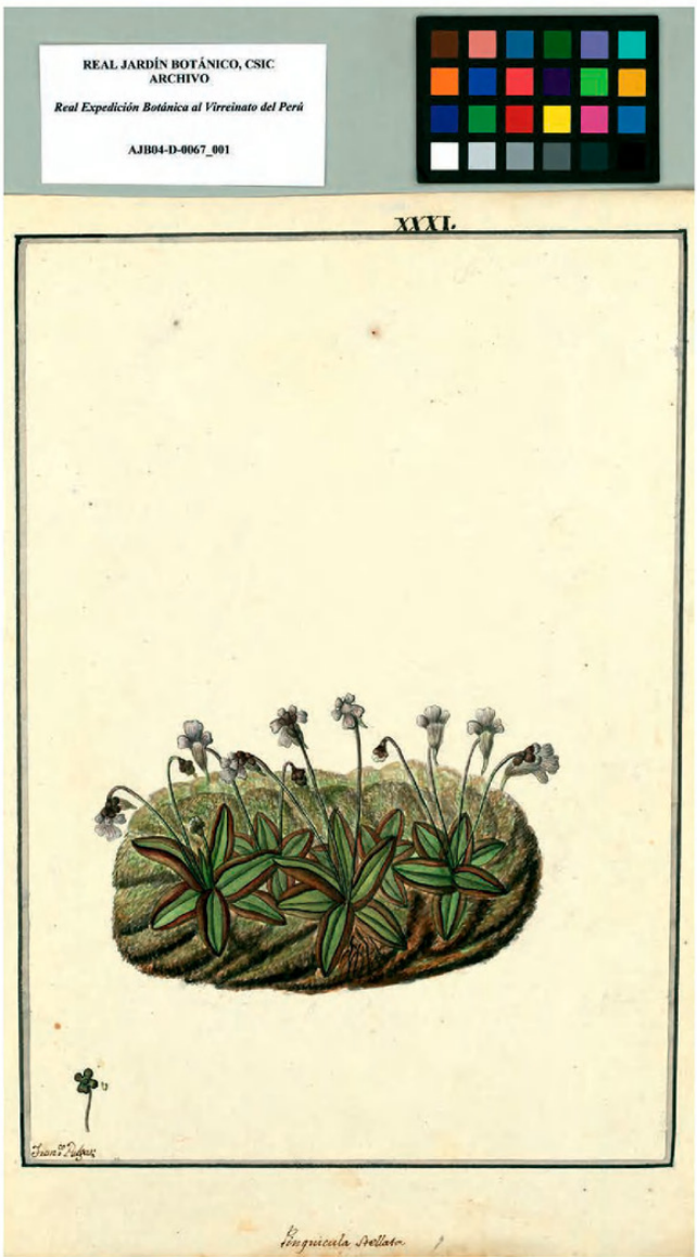
Figure 3: Pinguicula stellata . Photocopy of Francisco Pulgar's drawing. Archivo del Real Jardín Botánico (CSIC), Madrid. Div. IV. Photocopy reproduced with permission.