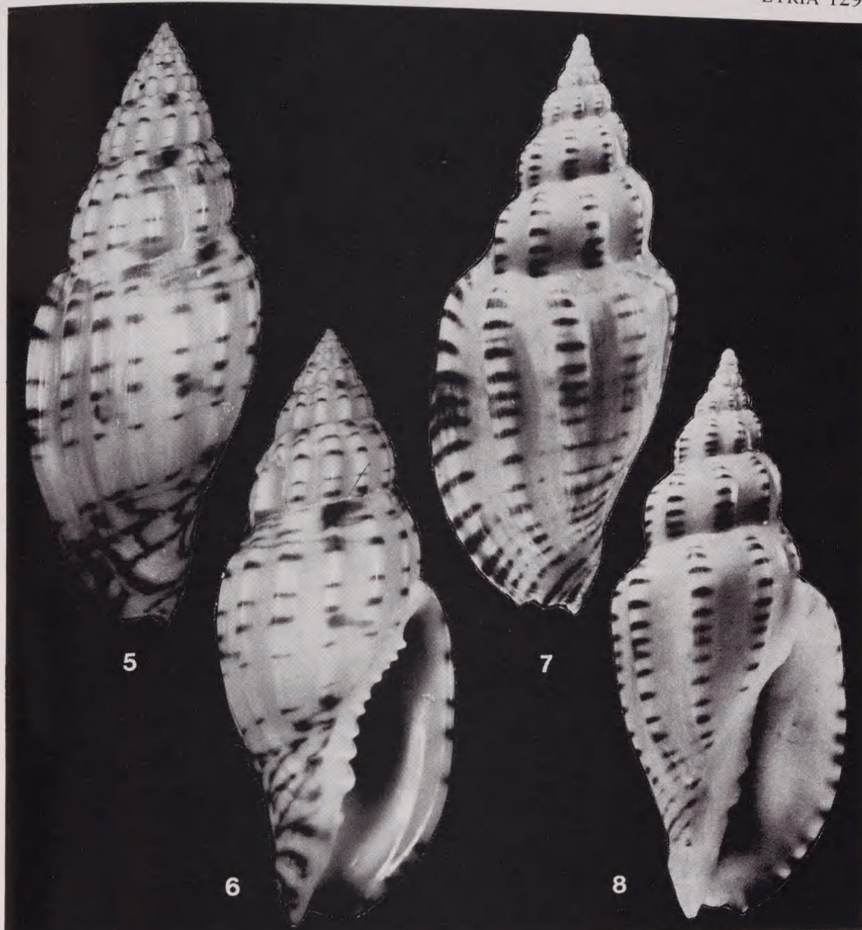
Figs. 5-8. 5, 6. Lyria santoensis Ladd. Off Kota Kirabalu, Sabah; 55.0 mm. 7, 8. L. kuniene Bouchet. Holotype MNHN Paris; 64.0 mm (immature — from Bouchet, 1979, figs. 1, 2).

Ladd (1975) described Lyria santoensis from fossiliferous marls of the Kere River on Santo I, Solomon Is, and the age determination yielded a tentative figure of between 14,000 and 25,280 years. Ladd's description appeared in October 1975, and was soon followed by descriptions of living specimens from Taiwan by Lan (30 November 1975) and Habe (22 December 1975).