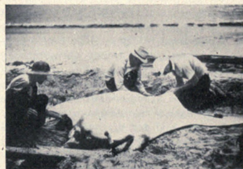
MAKING CAST OF MANTA

The Pacific species of devil fish ( Manta hamiltoni ) was known to be especially abundant in the waters surrounding Indefatigable and South Seymour Islands in the Galapagos Archipelago. Here it was possible to select, from several that were seen in the course of one afternoon, a female specimen about ten feet long and twelve feet across. This was only a half grown example, but one of the fully grown ones of twenty to twenty-four feet in breadth with a weight of three or four thousand pounds would have been too large to handle or to exhibit in the best possible way. Even though our specimen was one of juvenile proportions, sixty continuous hours were required, working with all possible speed, to make a plaster mold of both top and bottom sides so that upon our return to Field Museum a complete reproduction in celluloid could be made.