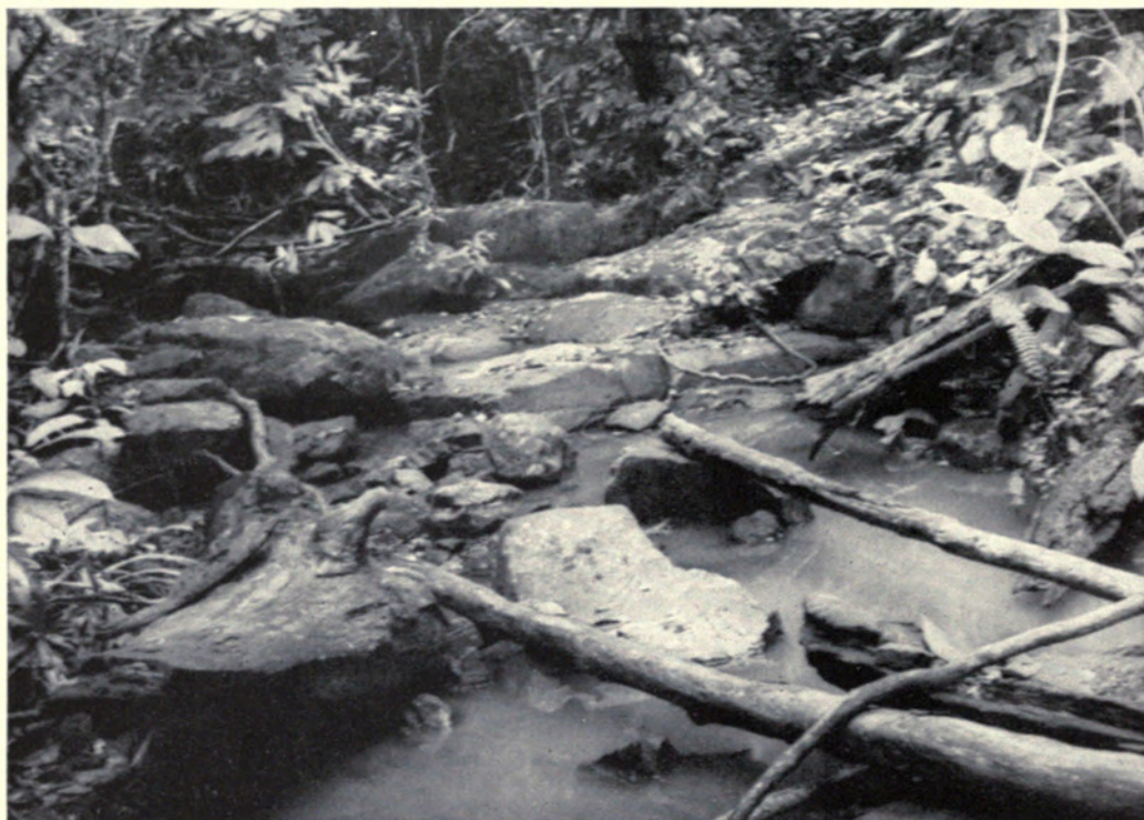
FIG. 87. Typical small forest stream in the Bukit Kretam Camp. Habitat of larval Megophrys hasselti and adult Rana kuhli .

The heaviest rains were over when the base at the Kretam camp was established. Nevertheless, frogs were still breeding. Most