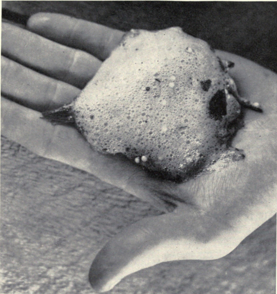
FIG. 90. Close-up of egg-mass of Rhacophorus ottilophus .

Localities .—Kinabatangan District, near mouth of Kretam Kechil River (11 adults, 62 larvae). Labuk District, Beluran (1). Sandakan District, Sandakan (1), Mile 5, Sandakan (1).