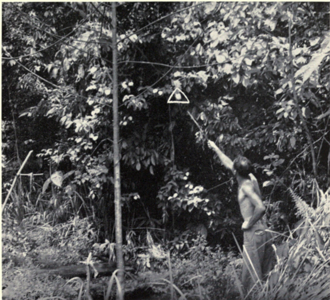
FIG. 88. Egg-mass (in white triangle) of Rhacophorus leucomystax above small pool at edge of large clearing.