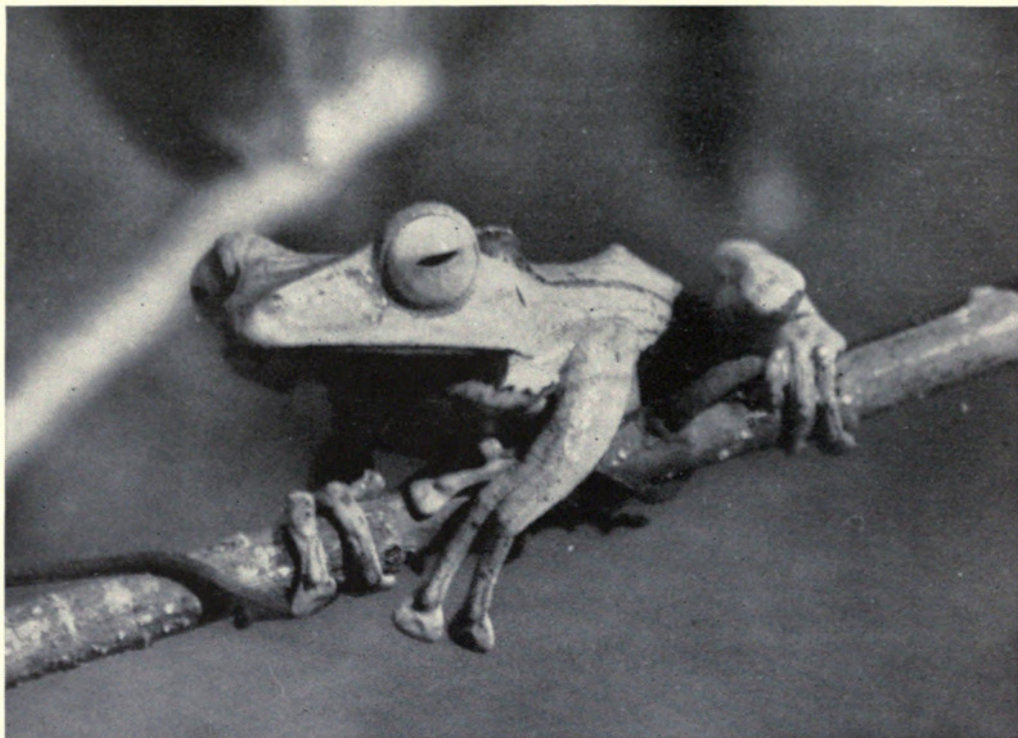
FIG. 89. Adult Rhacophorus ottilophus .

suffused with brown. In alcohol dorsal coloration pale brown with dark lines.