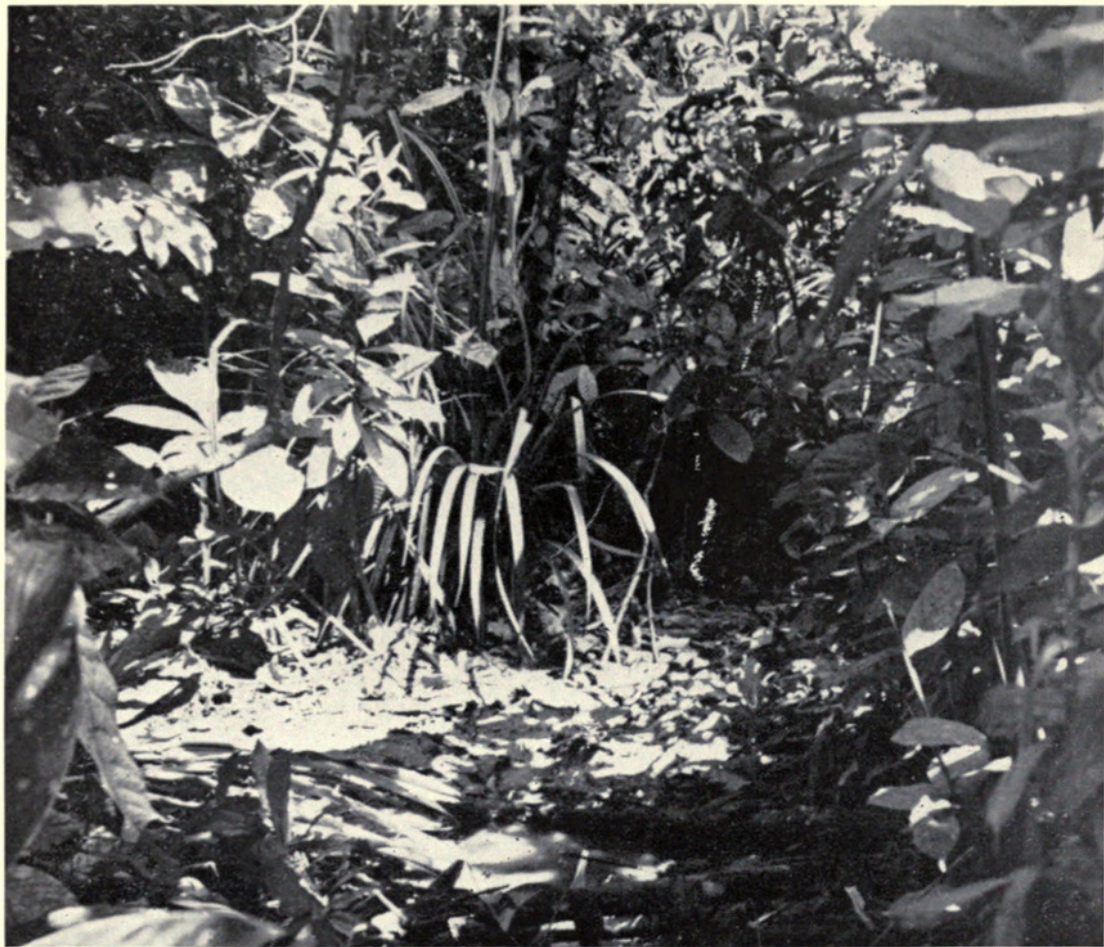
FIG. 86. Tangled vegetation in swampy ground at edge of Bukit Kretam camp clearing. The pool in the foreground contained tadpoles of Rhacophorus leucomystax and R. otitophus ; adults of both were abundant in the surrounding vegetation. The narrow-leaved sedge in the center background is a species of Mapania (family Cyperaceae). The broad-leaved plants belong to the families Anonaceae, Marantaceae, Sapindaceae, and Zingiberaceae. The broadest leaf in the background is about 15 cm. wide.