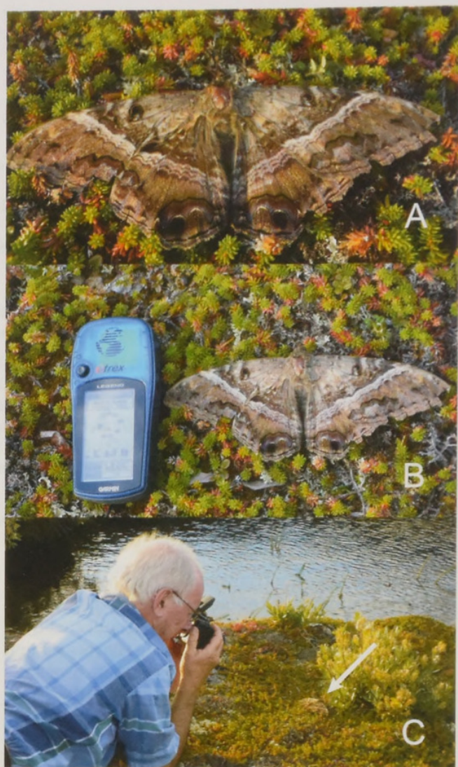
FIGURE 2. The presence of Ascalapha odorata (Black Witch) near Churchill, Manitoba. A and B: The worn but living specimen collected near Bird Cove, 18 km east of Churchill, Manitoba, on 18 August 2016. C: Paul Hebert documents the most exciting catch of the day.

The Churchill specimen is the first individual of A. odorata found in the Low Arctic tundra. This individual probably arrived in the Hudson Bay area on strong southerly winds about a week before its discovery (P. Kevan, personal observation). The specimen is now housed in the Biodiversity Institute of Ontario at the University of Guelph, and its photograph is accessible on the Barcode of Life Data Systems (Ratnasingham and Hebert 2007): http://www.boldsystems.org/index.php/Public_RecordView?processid=DSCNI024-07 .