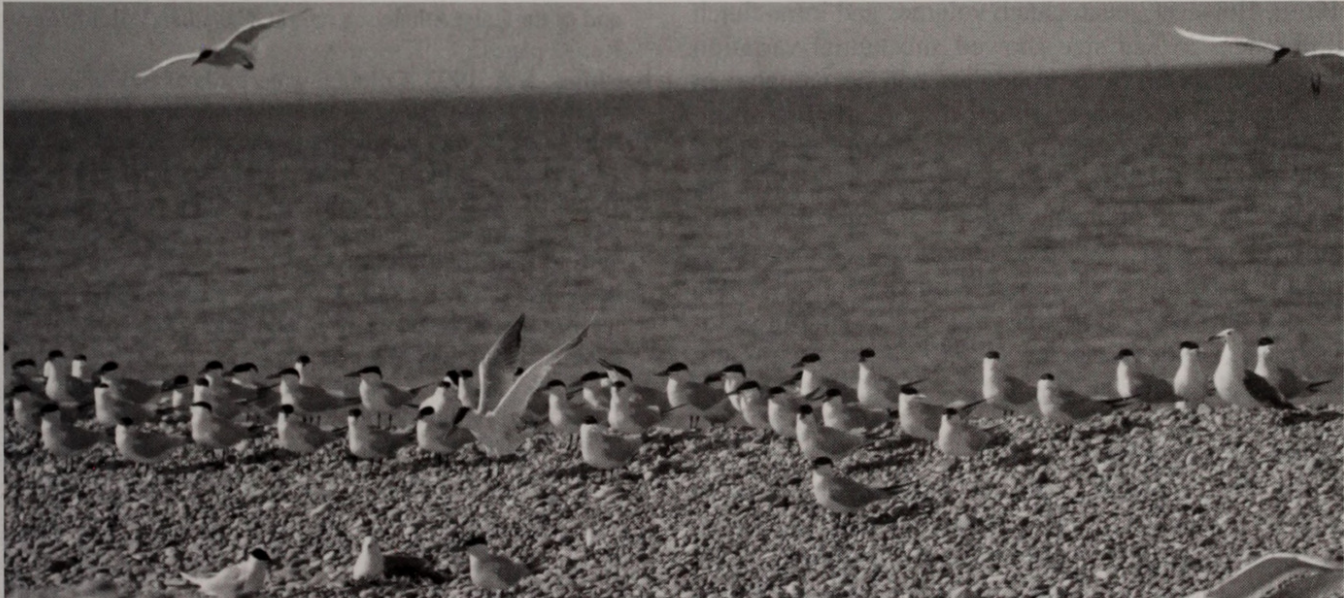
FIGURE 3. Approximately one-third of the Caspian Terns breeding on Egg Island, Lake Athabasca, 14 June 2009.

In addition, there were 87 California Gull nests and 3 Herring Gull nests. Clutch size distribution data were also collected and are shown in Table 1. Average clutch size for Caspian Terns breeding in northern North America is three eggs (Bent 1921). Similarly, modal