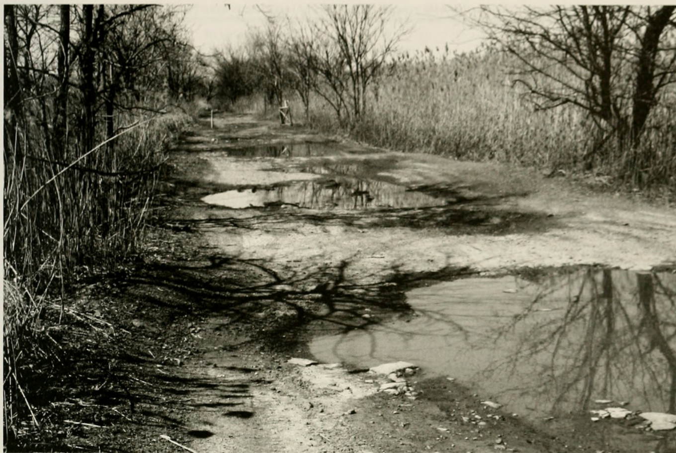
FIGURE 1. Habitat of Caenestheriella gynecia in New Jersey.

vehicles (including “four-wheelers” and motorcycles), and road vehicles (pickup trucks and sport-utility vehicles) were observed using the road at the Hyde Park locality. The puddles at the Bristol Beach State Park site were created and maintained by all-terrain vehicle use. We believe the puddle habitats at these four sites were created and maintained by wheeled vehicles; the puddles at the Rhinebeck locality appeared less recently disturbed and may have been created by farm vehicles. The dirt road at the Hyde Park locality was bordered by hardwood forest and woodland pools. The dirt road at the Rhinebeck locality was fringed by tall shrubs and small trees in the midst of a wet meadow and old field. In New Jersey, the dirt road was fringed by Common Reed ( Phragmites australis ), tall shrubs, and small trees, and was raised ca. 1.5 m above the level of extensive, formerly tidal, marsh now dominated by common reed. The ATV trail at the Bristol Beach site was bordered by second-growth hardwood forest.