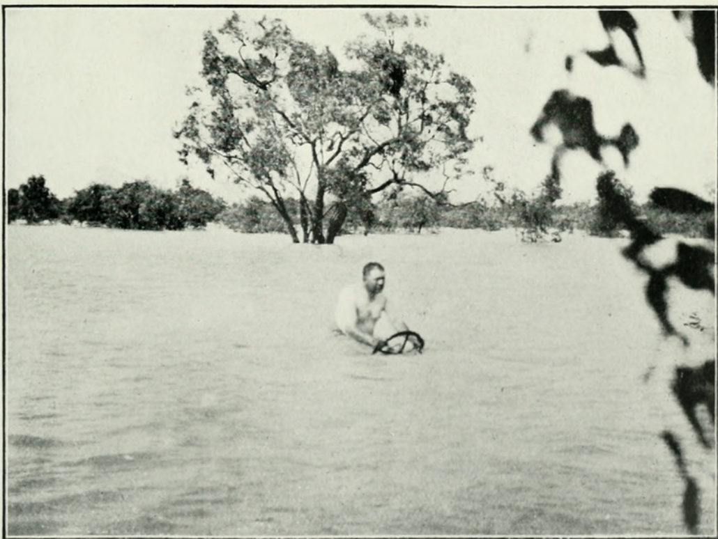
Crossing Newcastle Waters after a "Cloud burst." The car (almost submerged) is being hauled over by a second car.