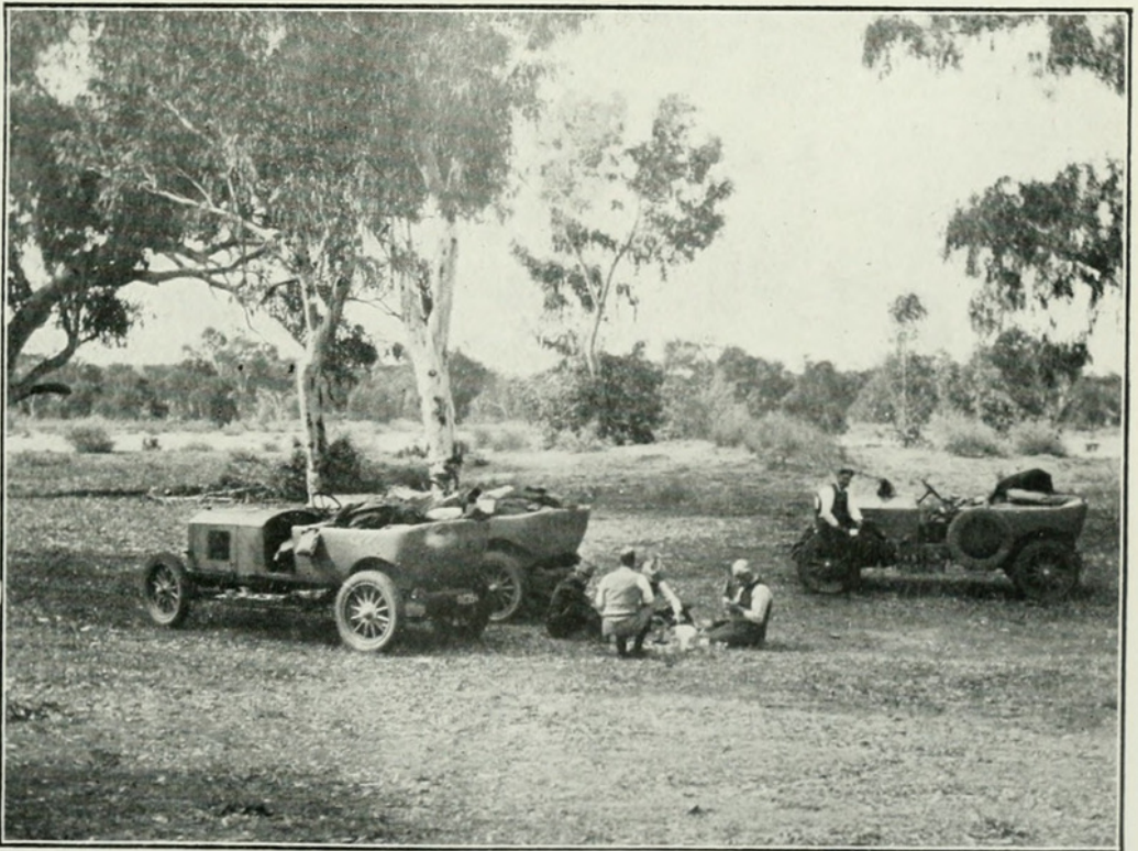
Lunch in the haunt of the Red-breasted Babbler ( Pomatostomus rubeculus ).