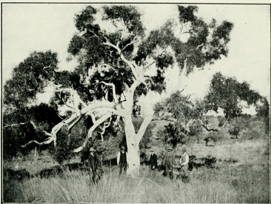
A white barked Gum ( Eucalyptus terminalis ) a feature of a large area of the Northern Territory and the nesting tree of hawks and eagles.