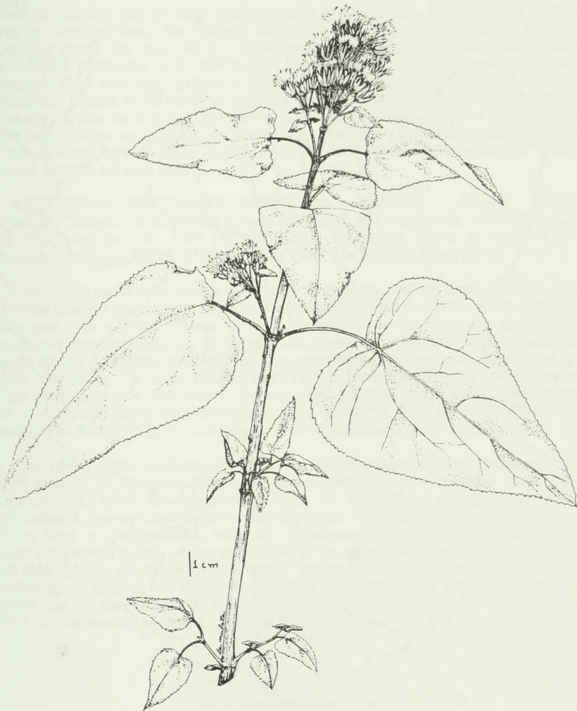
Figure 1. Ageratina jocotepecana , from holotype.