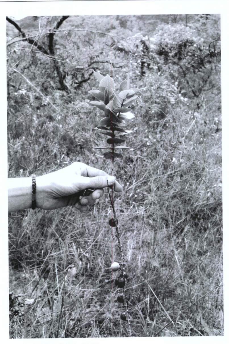
Figure 2. Plinia nana. Branch (Alves & Sobral 168).

nia cauliflora (Martius) Kausel, P. jaboticaba (Vellozo) Kausel, P. trunciflora (O. Berg) Kausel (Kausel, 1956), P. phitrantha (Kiaerskou) Sobral, and P. grandifolia (Mattos) Sobral (Sobral, 1994). These jaboticaba species are generally assigned to Myrciaria O. Berg (Berg, 1855-1856, 1857-1859), but Kausel (1956) proposed their inclusion in the genus Plinia due mainly to their seeds with separate plano-convex cotyledons rather than the fused ones of Myrciaria. This last genus is characterized mainly by fused bracteoles, a calyx-tube deciduous at anthesis, and seeds with generally fused cotyledons, while Plinia presents distinct bracteoles, a persistent calyx-tube, and seeds with separate, planoconvex cotyledons. Such limits unfortunately are not clear; some Myrciaria present plano-convex cotyledons and some Plinia may have a tardily deciduous calyx-tube. Considering such characters, assigning some species to one genus or the other