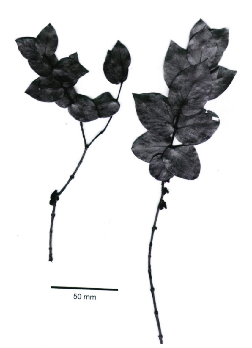
Figure 1. Plinia nana . Scanned image of isotype at MO ( Hatschbach et al. 69578). NOVON 15: 586–589. PUBLISHED ON 12 DECEMBER 2005.

The American genus Plinia extends from Antilles to Uruguay and comprises about 30 species (Landrum & Kawasaki, 1997), although this estimate does not include some eastern Brazilian tree species commonly known as "jaboticabas," widely cultivated for their edible fruits, as for example Pli -