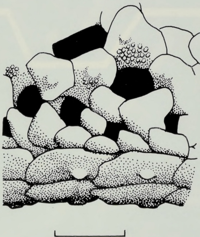
Fig. 2. — Echinaster sepositus madseni . Holotype. Dorso-lateral view of small proximal part of arm, distal to right, including eleventh and twelfth supero- and inferomarginal plates. Scale 1 mm.

Well developed patches of crystal bodies present on some of the more lateral (abradial) abactinal plates (Fig. 2), usually on the slightly hollowed area below the elevation bearing the spine; also present on some