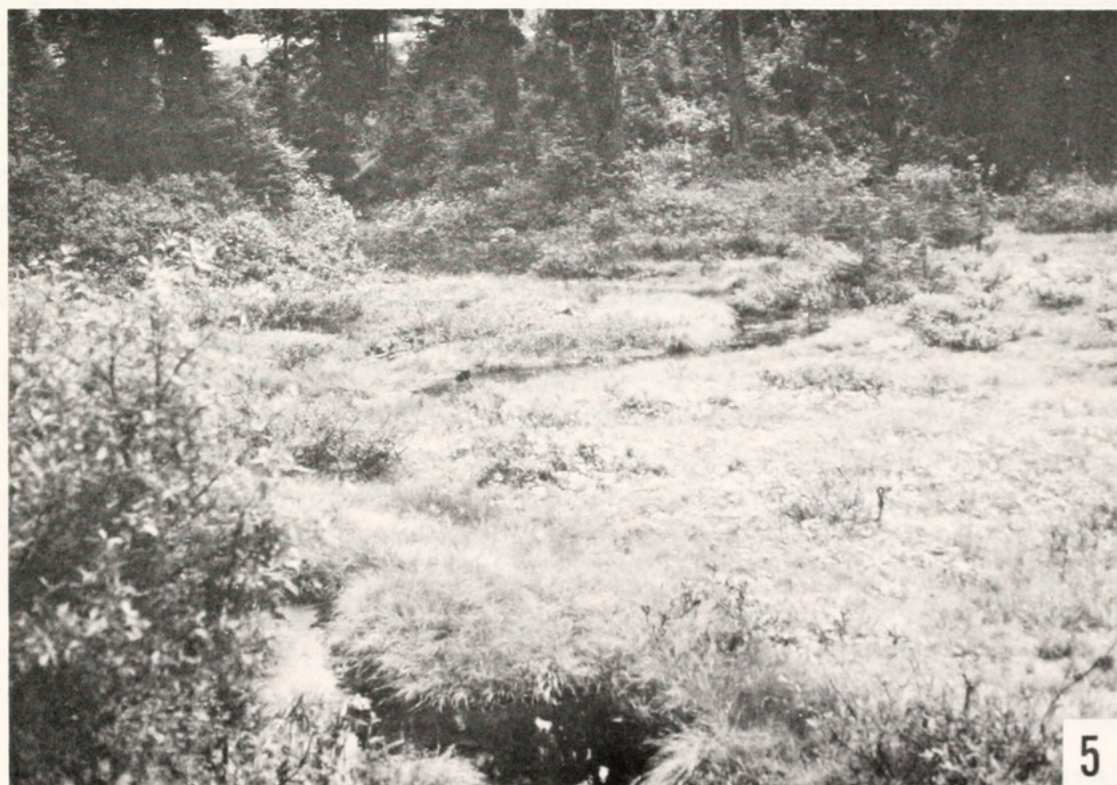
Fig. 5. Type-locality habitat of Limnellia rainier , n. sp.