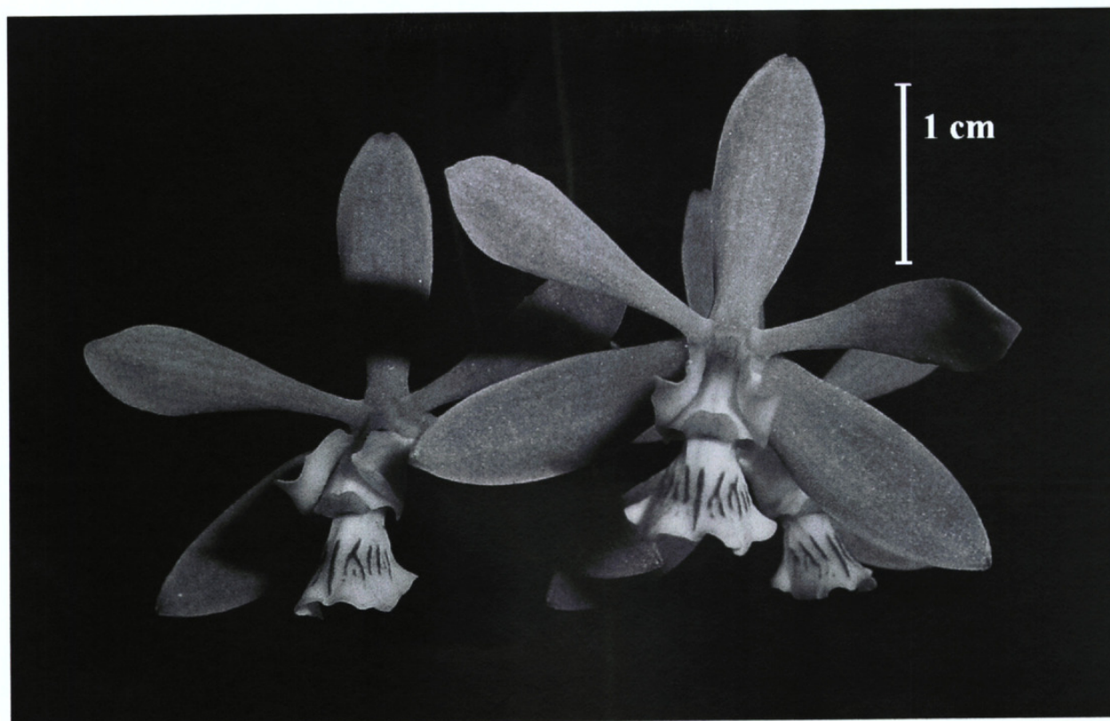
Figure 2. Encyclia garciae-esquivelii Carnevali & I. Ramírez. Flowers (photograph by G. Carnevali, based on G. Carnevali & I. Ramírez 6811).

green, the callus white with a few purple nerves, the column apically white, at base pale yellow-green with 3 faint lines of fine purple dots, the anther dull pink with thick, deep dark purple margins; sepals 7-nerved, elliptic or oblong-elliptic, obtuse or obtusely acute, the laterals very slightly oblique, more attenuated basally than the dorsal sepal, the apex on the external face with dense verrucae and bluntly keeled; dorsal sepal 15.5\text{--}16 \times 5.5\text{--}6 mm; petals 14.8\text{--}15.2 \times 5\text{--}6 mm, 1.5 mm wide at base, 5-nerved, spatulate, obtuse to obtusely acute at apex, apically with a thickened mucro; labellum 3-lobed, the lateral lobes parallel and laxly embracing the column, upon spreading forming an angle of less than 45^\circ in relation to the main labelar axis, 14\text{--}15 mm long along its main axis, 13\text{--}14 mm across the spread lateral lobes, midlobe 8\text{--}9 mm long from the point where lateral lobes arise, broadly obovate in general outline including the basalmost, callus-including section; the blade of the midlobe 6\text{--}7 \times 9.5 mm, transversally subquadrate-rhomboid, broadly truncate and shallowly emarginated or 2-lobed at apex, the upper surface with the nerves keeled and coarsely verruculose with the verrucae arranged in 8 longitudinal lines; lateral lobes 9\text{--}9.5 mm long along the external margin (ontogenetically the most basal), 6\text{--}6.5 mm long along the internal margin, ca. 3.5 mm wide at base,