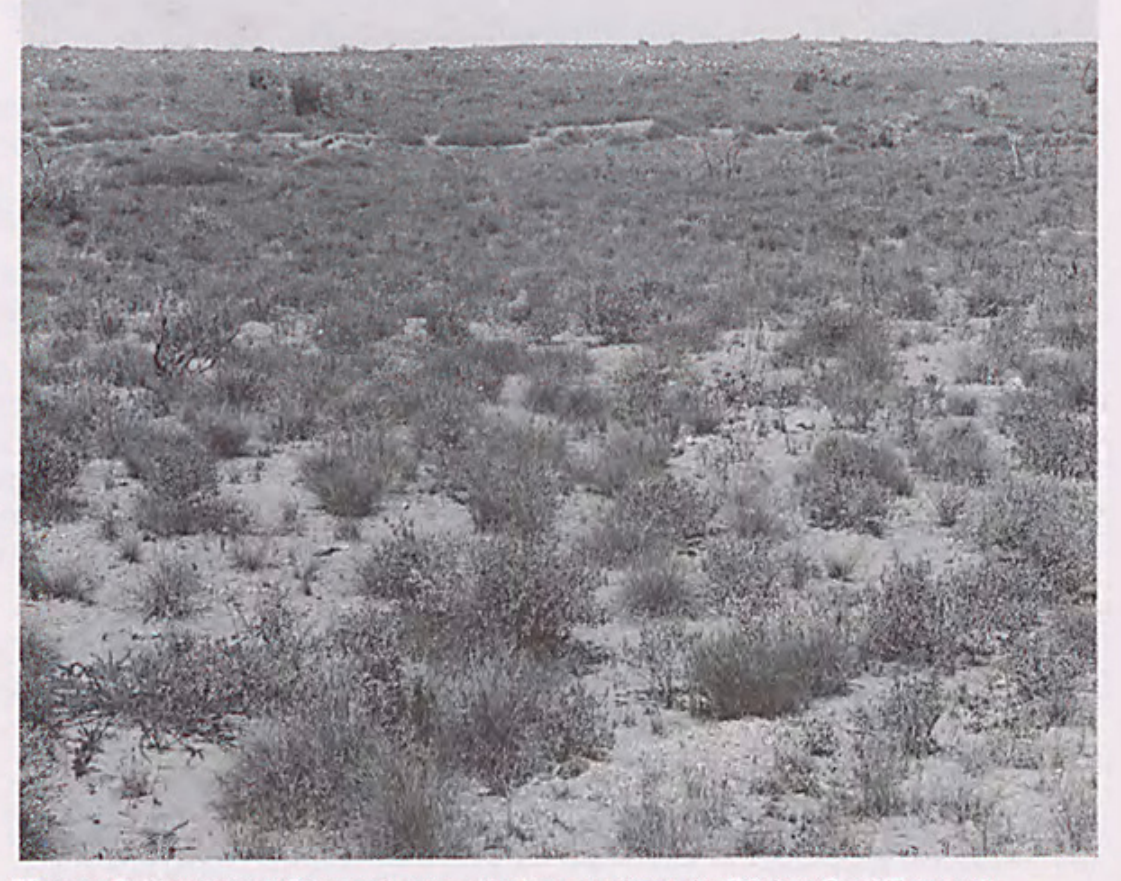
Figure 2. Habitat of Ctenophorus clayi approximately 82 km S of Exmouth.

In the Exmouth Gulf region specimens have been found on rolling red sandplain with low shrubs (Figure 2), where they have been first seen sitting on small rocks and on open ground between shrubs. When pursued they either run short distances into the base of shrubs or, if the ground surface is hot, ascend small open shrubs to a height of about 30 cm. In captivity one individual dug a short burrow with two entrances which it often back-plugged when inside. In digging, the lizard sometimes used the two legs on the same side simultaneously. Captive individuals (N = 3) also often ascended a small stump to get closer to the light/heat source.