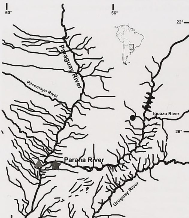
Fig. 5. Map showing the three collecting sites of Hemigrammus tridens in the Paraná Basin. Circle: Paraguay (Country), Güyraugua River; star: Argentina, Corrientes, San Cosme; triangle: Argentina, Chaco, Puerto Tirol.

with the Paraguay River (Fig. 5). Güyraugua river is a tributary of Monday river in the country Paraguay. Puerto Tirol is located on the coast of Paraná River in Argentina. The environment in which H. tridens was collected close to San Cosme is a permanent lake, more than 1 m deep, with profuse vegetation and abundant wood on substrate (Fig. 6). In this habitat the following species were found: Aphyocharax nattereri , Hyphessobrycon elachys , H. eques , H. igneus , H. luetkenii , Moenkhausia dichroua , Serrapinnus calliurus , Pyrrhulina australis , Apistogramma borellii , Cichlasoma dimerus , and Laetacara dorsigera (captured in December 1994 and/or September 1995).