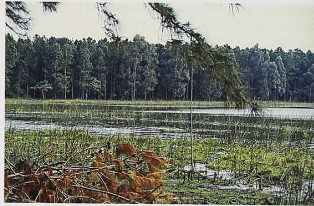
Fig. 6. Permanent lake close to San Cosme (27°22'34"S-58°23'47"W), RN 12, km 1072, Depto. San Cosme, Corrientes, Argentina.

Eigenmann & Ogle (1907) described Hemigrammus tridens based on two specimens, designated “Type” and “Cotype”, from the Pypucú stream in Paraguay, being then deposited both at the Indiana University collection (IU 11262). These specimens are today housed at the California Academy of Sciences in the lots CAS 58609 (holotype) and CAS 61474 (paratype). This type status is supported by the article 72.4.6 of the International Code of Zoological Nomenclature (1999). A decade