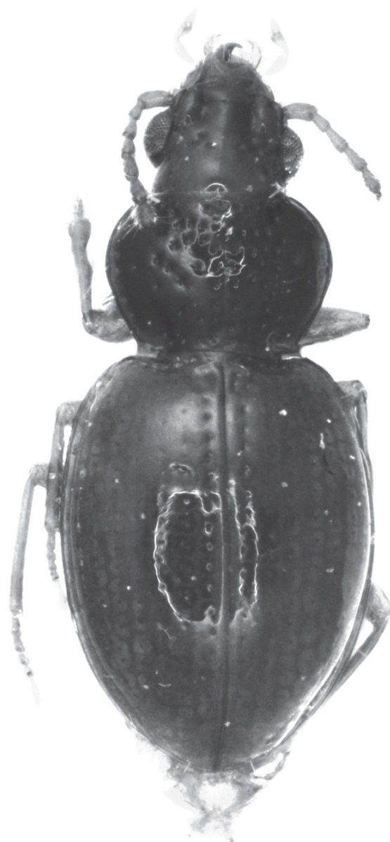
Fig. 1. Mecyclothorax moorei n.sp., female paratype, habitus. Body length: 3.25 mm.

Colour. Rusty red, centre of head, pronotum, and disk of elytra darker, piceous to almost blackish, but dark colouration of elytra very ill delimited. Suture, base, and margins of elytra reddish, antennae reddish, mouth parts and legs dirty yellow. Lower surface of head, prothorax, and middle of abdomen piceous, rest reddish.