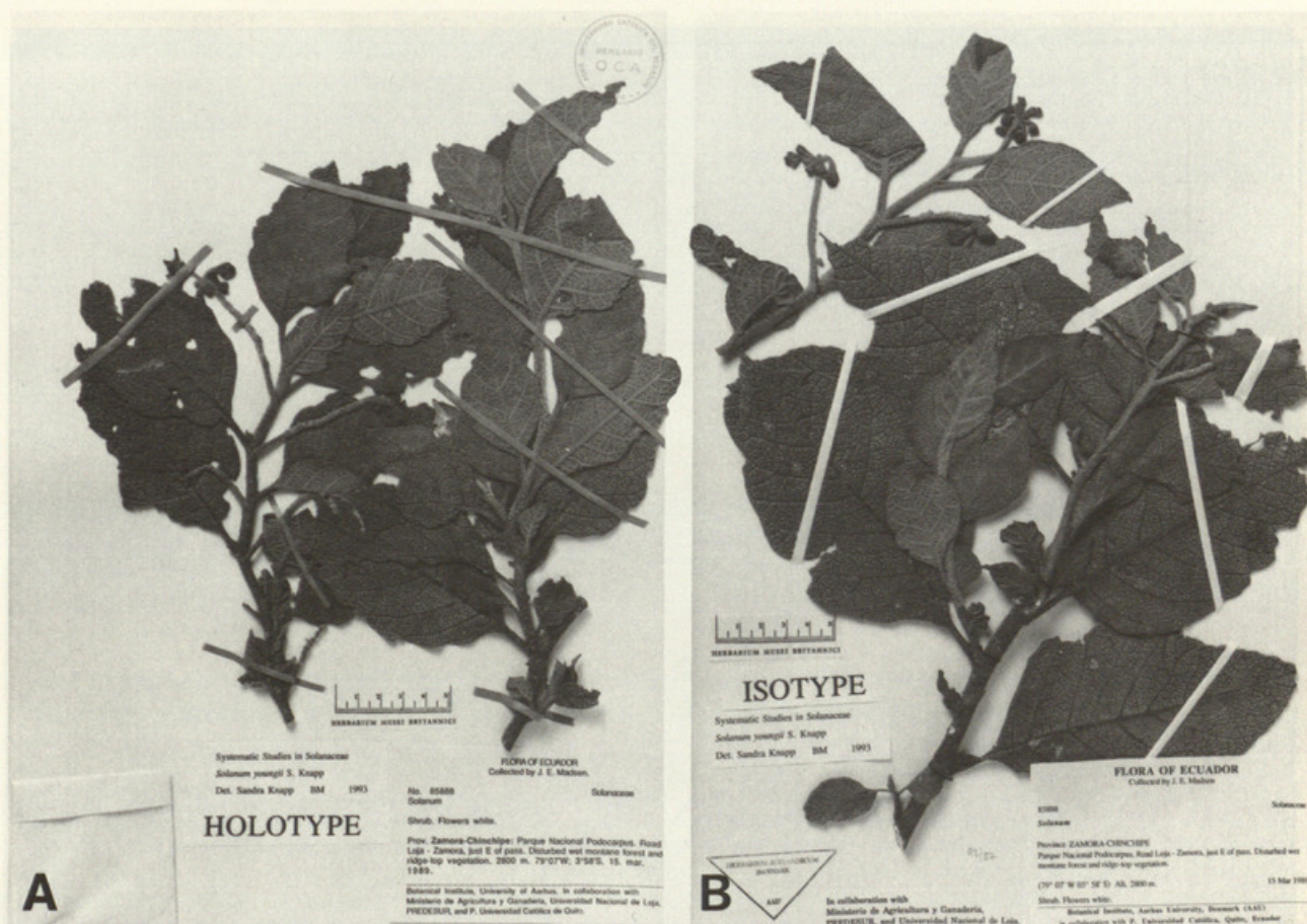
Figure 1. —A. Holotype of Solanum youngii S. Knapp (Madsen 85888, QCA). —B. Isotype of Solanum youngii (Madsen et al. 85888, AAU).

Distribution. In wet montane and cloud forest, often in forest patches above timberline, in southern Ecuador and northern Peru, from 2800 to 3500 m. Figure 2.