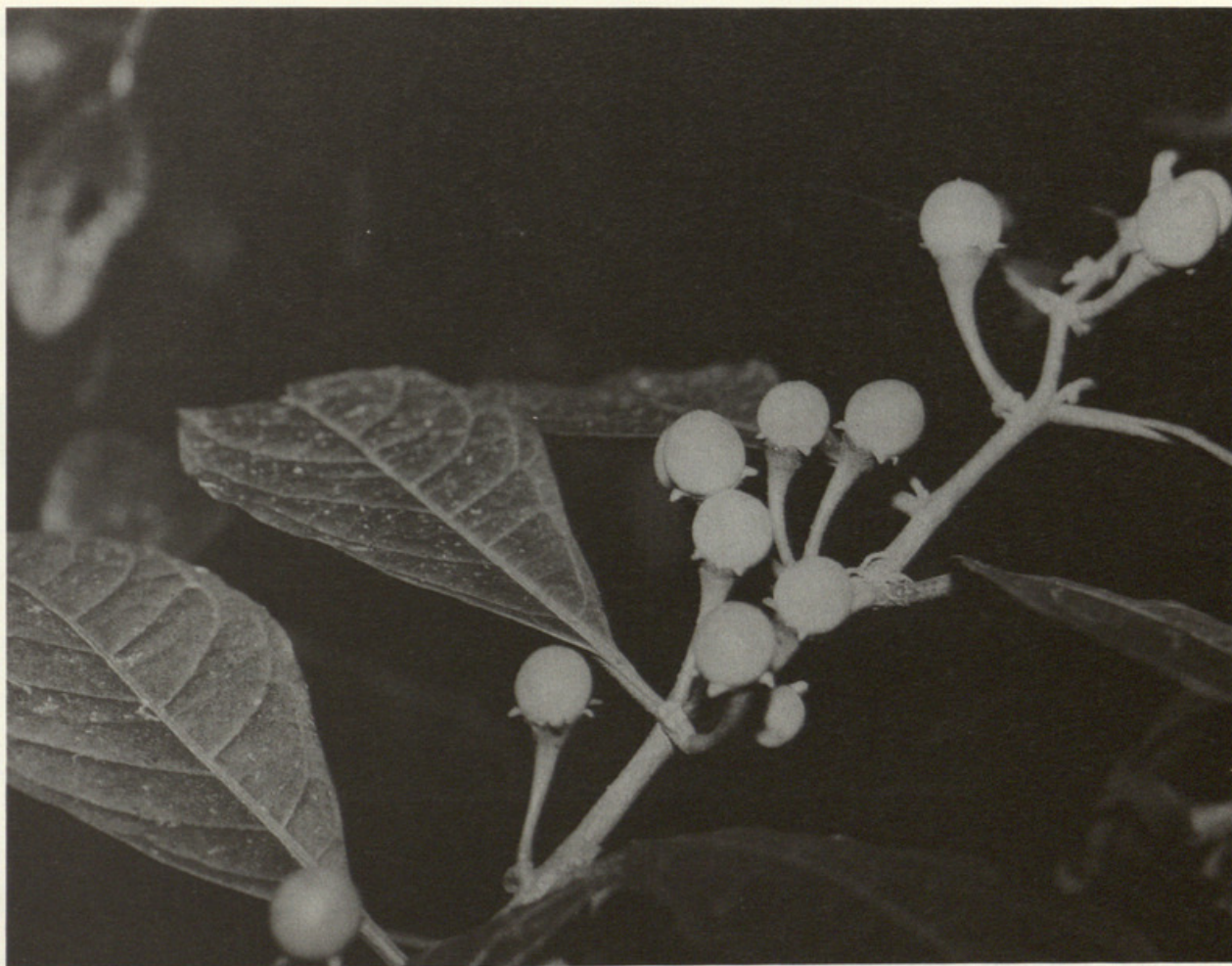
Figure 3. Solanum quebradense S. Knapp (Knapp & Mallet 6778, Edo. Trujillo, Venezuela). Photo actual size.

tinguished from that species by its simple rather than dendritic pubescence, narrower leaves, glabrous ovaries, and smaller, less fleshy flowers. These two species share uniseriate, rather than arachnoid, pubescence. Fruits of Knapp & Mallet 6778 were very pale green to nearly white in color. Only the type collection bears flowers.