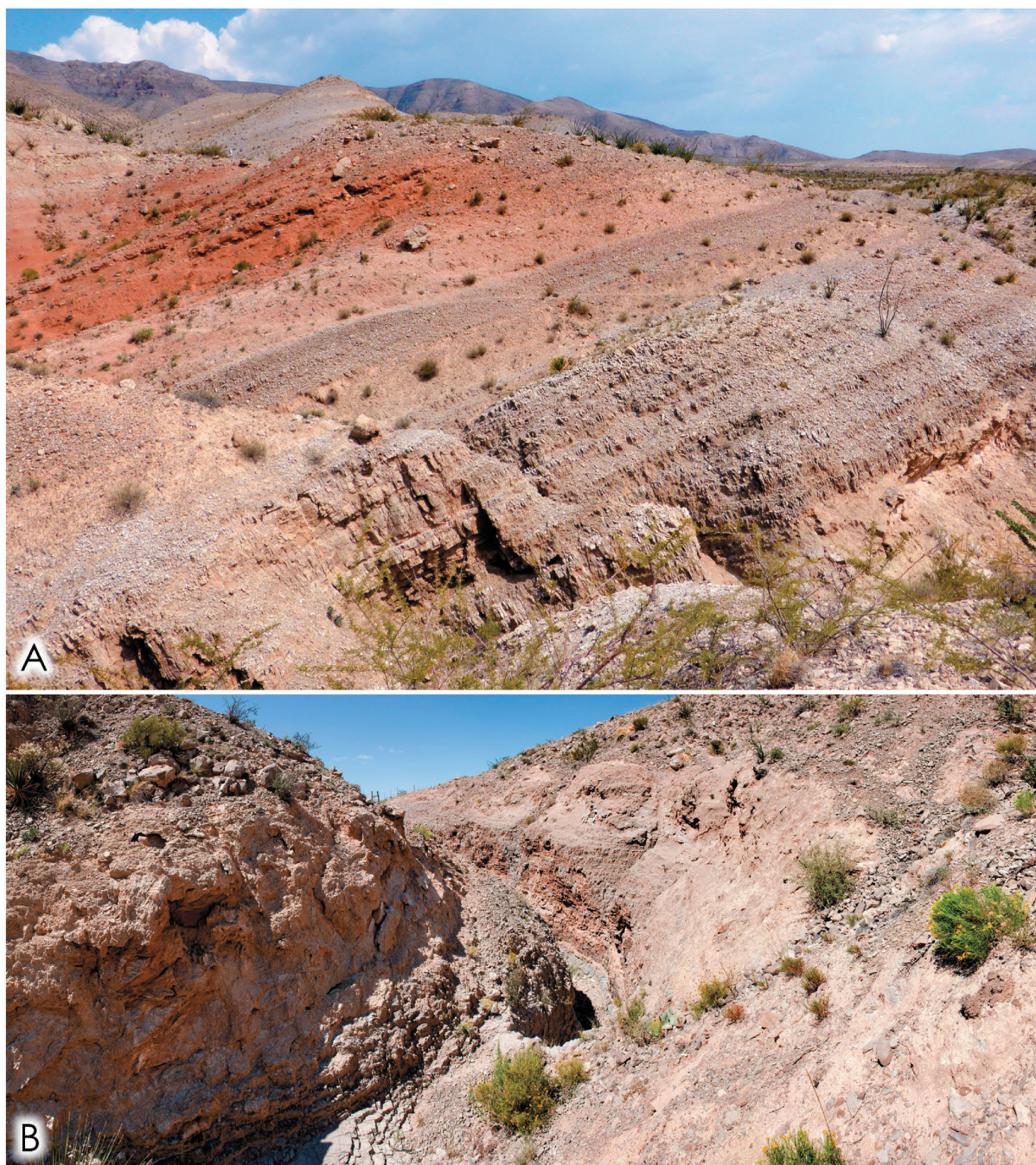
FIG. 2. Habitat of N. hypercorax : A. at the type locality; B. at the site of Alexander 1330 .

7-branched. Stems branched throughout, 3–6 from a branched, woody caudex, older woody stems to 1 cm in diameter, herbaceous stems to 1 mm diameter. Cauline leaves succulent, strongly overlapping, 3–6 times longer than wide, the larger (18–)22–40(–48) mm long, (4–)6–12(–14) mm wide, oblanceolate to spatulate, attenuate at the base and obtuse to acute at the apex, margins entire to weakly sinuate or, rarely, obscurely sinuate-dentate. Flowers with sepals (3.0–)4.0–6.0 mm long, 1.0–1.5 mm wide, broadly lanceolate in outline. Petals white, not fading purple on senescence, (rarely fading very pale lavender), 7–9 mm long, 3.5–4.5 mm wide, obovate to spatulate in outline, blade margins entire, dilate and denticulate at base. Stamens weakly tetradynamous, 2.5–5.5 mm long, anthers medifixed, straight and 1.5–1.8 mm long at anthesis, curling with