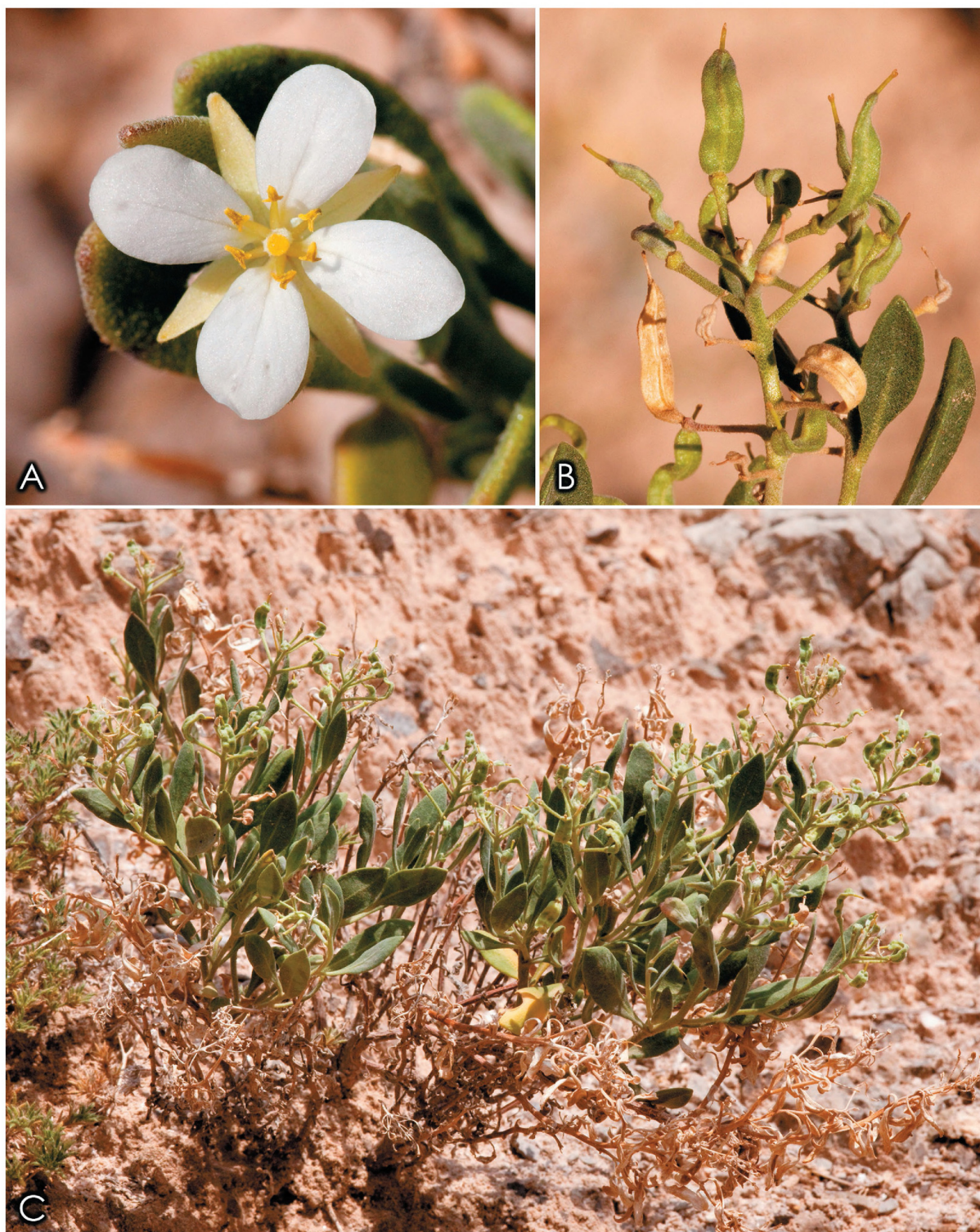
FIG. 4. Nerisyrenia hypercorax . A. Flower at the type locality. B. Fruit at the site of P.J. Alexander 1324. C. Plant habit at the type locality.

age, filaments 2.0–4.5 mm long. Ovary tomentose, 2–4 mm long, 0.8–1.5 mm wide, style glabrous, 1.3–2.2 mm long, stigma deltoid-sagittate, 0.5–0.8 mm long, somewhat decurrent on the style. Infructescences compact, (1.5–)2.0–4.5(–6.5) cm long, with 5–15(–20) fruits, middle internodes 1–5 mm long, pedicels straight, ascending to, infrequently divaricate, (3–)4–9(–13) mm long. Siliques obcompressed (angustiseptate), oblong, rounded-