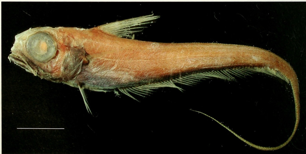
FIGURE 1. Lepidorhynchus denticulatus , BPBM 39286 (31.5 mm head length, 200 mm total length), from off Oahu, Hawaii.

COUNTS AND MEASUREMENTS. — (Hawaiian specimen first, followed by range of Australian specimens in parentheses.) First dorsal-fin rays II,11 (10–12); pectoral-fin rays i17 and i16 (i15–i18); pelvic fin rays 9 (9); branchiostegal rays 6; gill rakers first arch (outer/inner) 0+11 / 3+13 (0+10–14 / 3–4+13–15 = 17–18), second arch 3+14 / 2+13 (2–3+12–15 = 14–17 / 2–3+12–14 = 14–17); scale rows below origin of first dorsal fin about 8 (about 7–8), below mid-base of first dorsal fin about 5 (5.5), below origin of second dorsal fin about 6 (5–6.5); pyloric caeca 16 (15–25). Head length 31.5 mm (41.7–70.3 mm); the following in mm for Hawaiian specimen followed in parentheses by percent of head length for Hawaiian specimen and then Australian specimens: snout length 7.6 (22%, 20–24%); preoral length 5.1 (16%, 9–13%); internasal width 6.8 (22%, 16–21%); interorbital width 8.8 (28%, 20–25%); orbit diameter 12.6 (40%, 35–39%); suborbital width 2.8 (9%, 8–8%); postorbital length 12.6 (40%, 41–45%); distance orbit to angle of preopercle 11.9 (38%, 39–42%); length upper jaw 15.3 (49%, 47–50%); length barbel 3.1 (10%, 9–15%); length