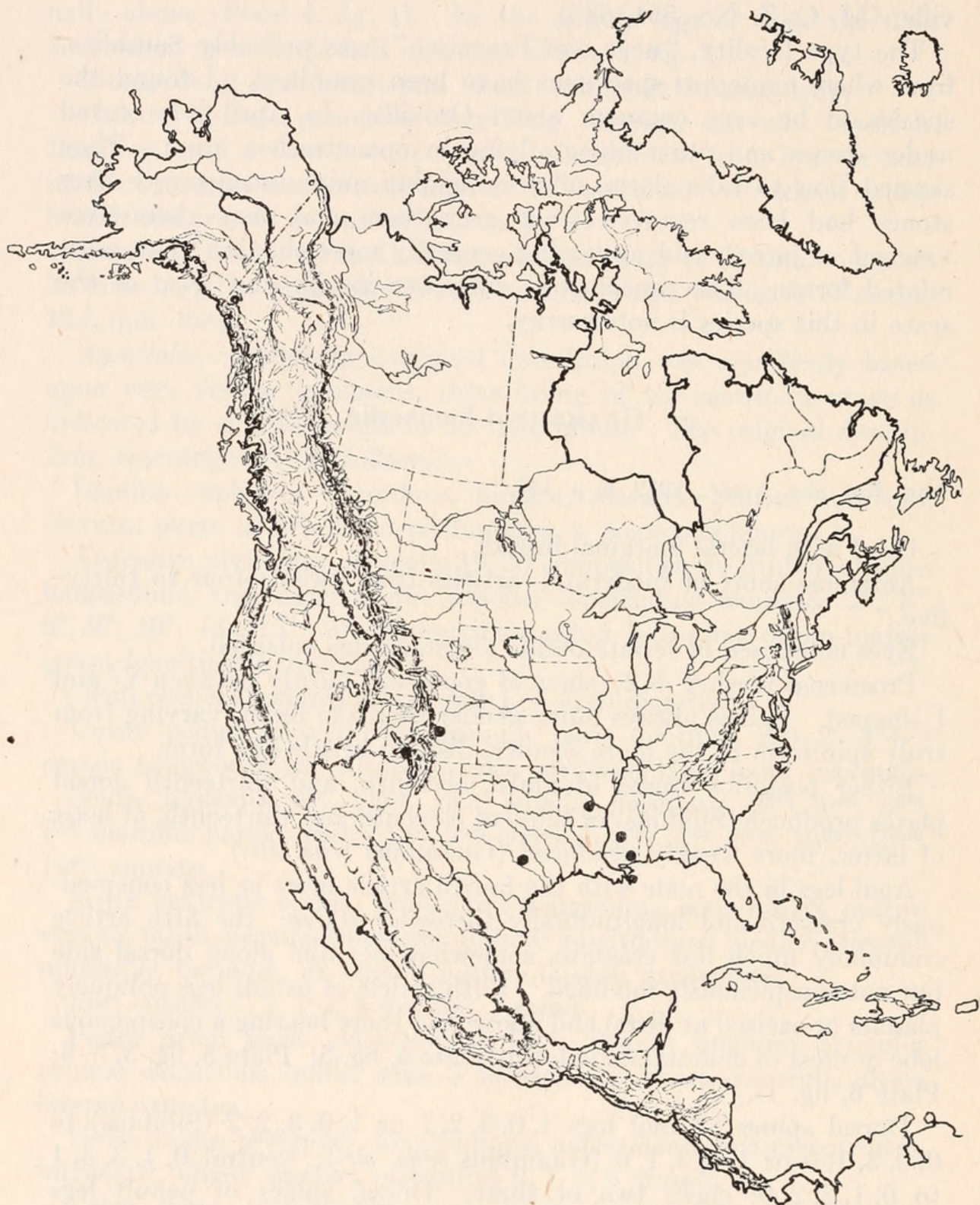
Fig. 3. Distribution of Guambius.