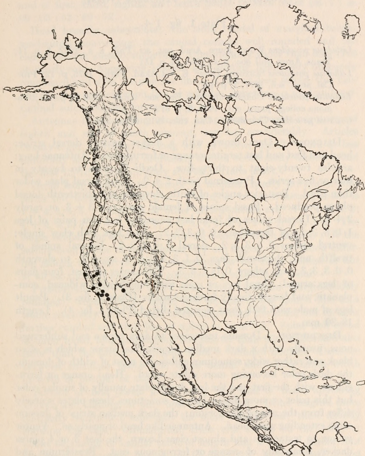
Fig. 1. Distribution of Gosibius.