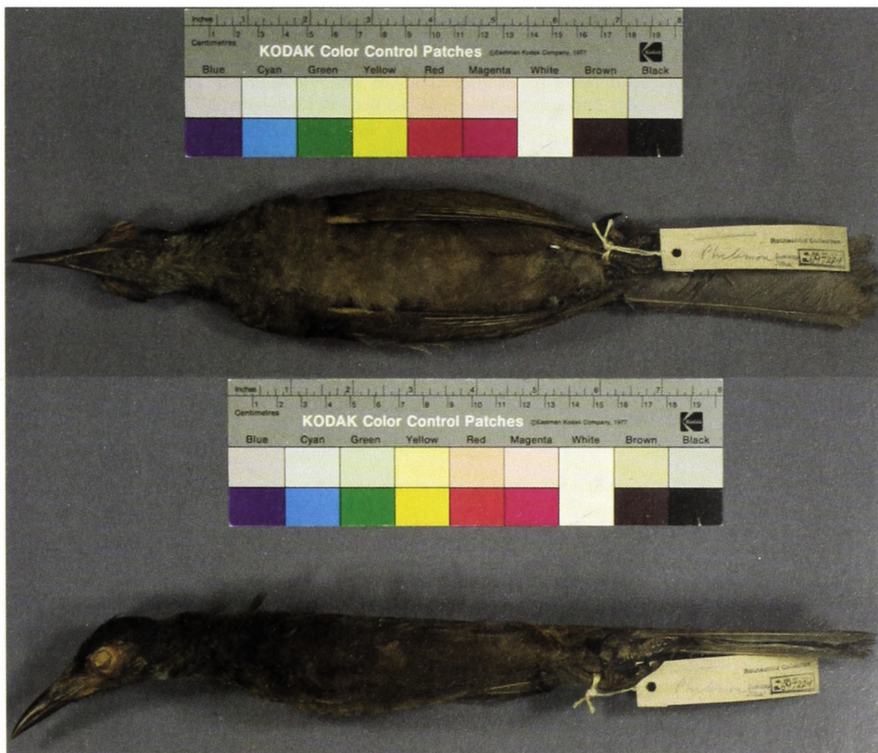
Figure 2. Ventral (top) and lateral views of AMNH 697224