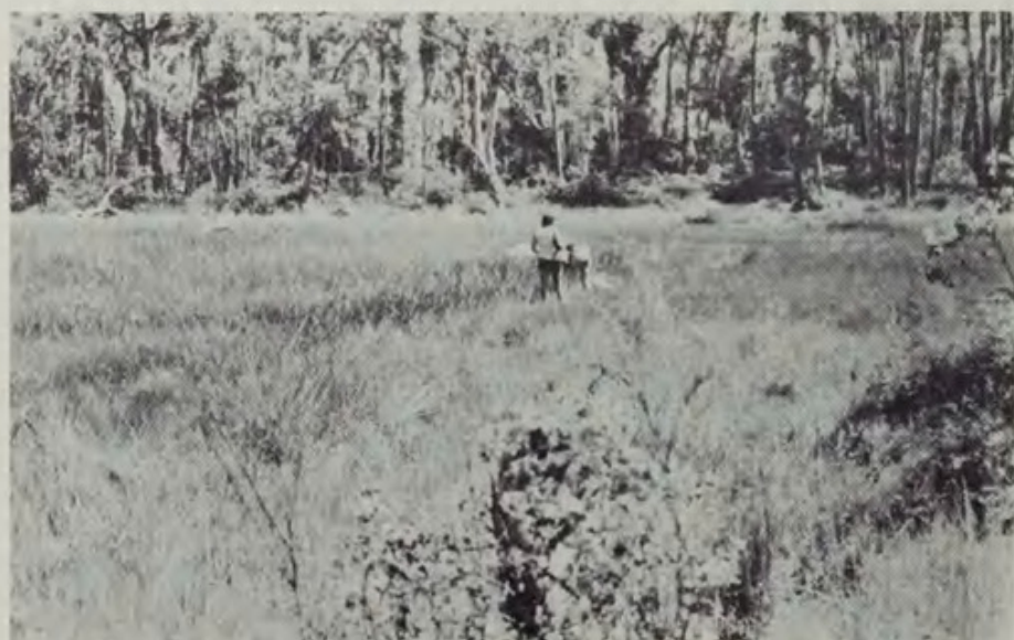
Fig. 4.—Yankee Point Swamp in the central part of the inundation area.

which the water striders, Gerridae, are common. Flies of the family Ephydriidae are found commonly hovering above the water surface.