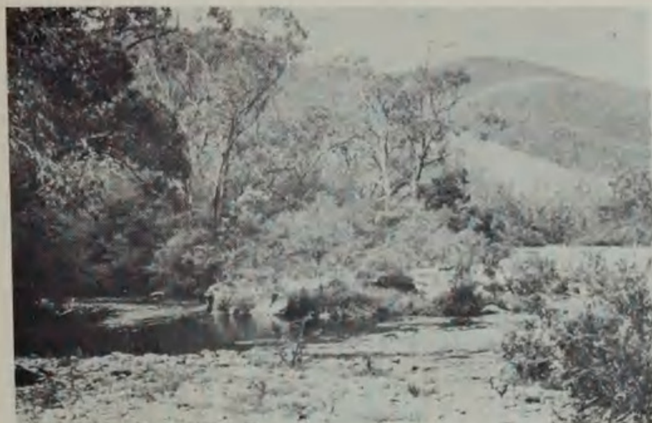
Fig. 2.—Mitta Mitta River at the junction with the Dart River.

of stones in the stream, while the minute hydrobiid gastropods are found in crevices in the stones and submerged timber.