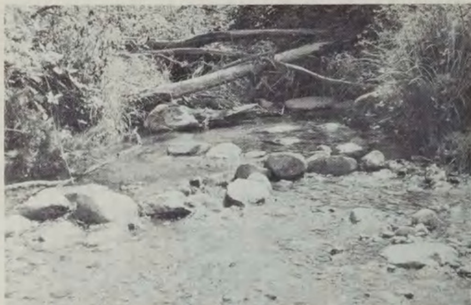
Fig. 3.—Small creek in the Upper Mitta Mitta Valley.