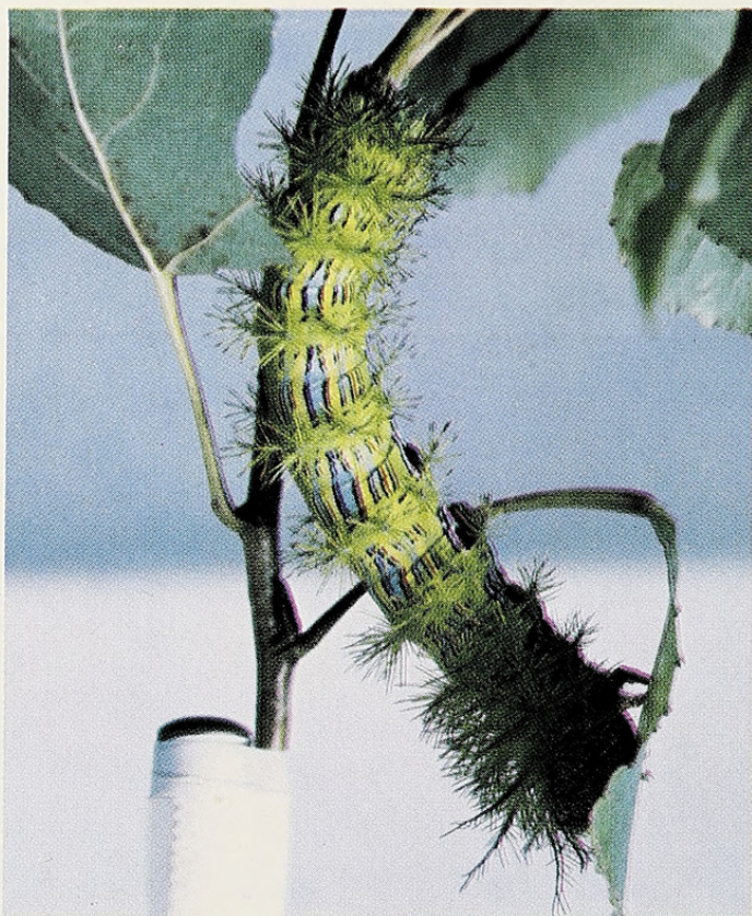
Figs. 1 & 2. A. cecrops peigleri n. subsp., holotype ♂. 2, id. paratype ♀. Fig. 3. A. cecrops peigleri n. subsp., larva, seventh instar, on Populus sp.