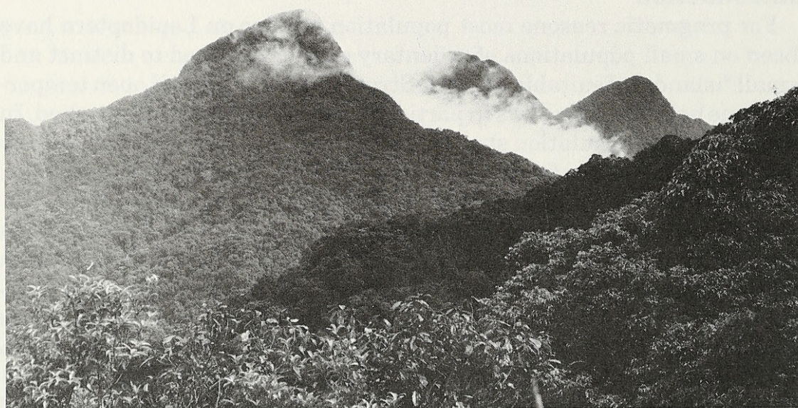
Fig. 1 The Tam Dao mountains covered by rain forest.

As steep slopes and dense vegetation made movement through the forest difficult, observations on the population of S. louisa were confined to a 5-meter wide belt on either side of a narrow path tracking a contour at 800 m asl. The path was only about 1 meter wide and did not affect the composition of the surrounding vegetation. It intersected an extremely steep slope (30° - 40°) so the canopies of the trees growing down-hill could be observed. A transect of 2 km was demarcated along this path, arbitrarily divided into 200 10-meters long sections numbered 1 - 200. The transect intersected three habitat types: closed forest (sections 1 - 112, 1120 meters), ecotone with forest on the down-slope and a deforested area on the up-slope (113 - 167, 550 meters), and ruderal (168 - 200, 330 meters). The ruderal zone was a mosaic of small cultivated fields and abandoned land overgrown by