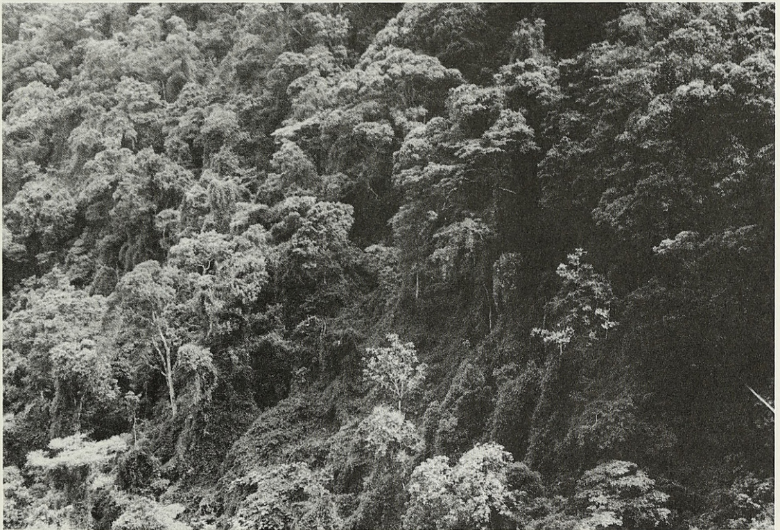
Fig. 2 Montane monsoon forest in the Tam Dao Mts., the habitat of Stichophthalma louisa .

The number of butterflies recorded flying per unit time during the forest transect counts was an index of activity used to evaluate diurnal activity of S.