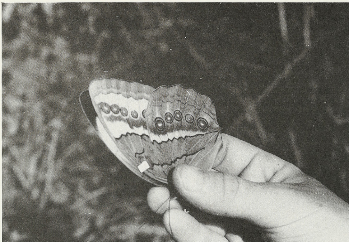
Fig. 3 Marked specimen of Stichophthalma louisa .

The seasonal dynamics of the Tam Dao population can only be inferred from our short-term observations made at various times over several