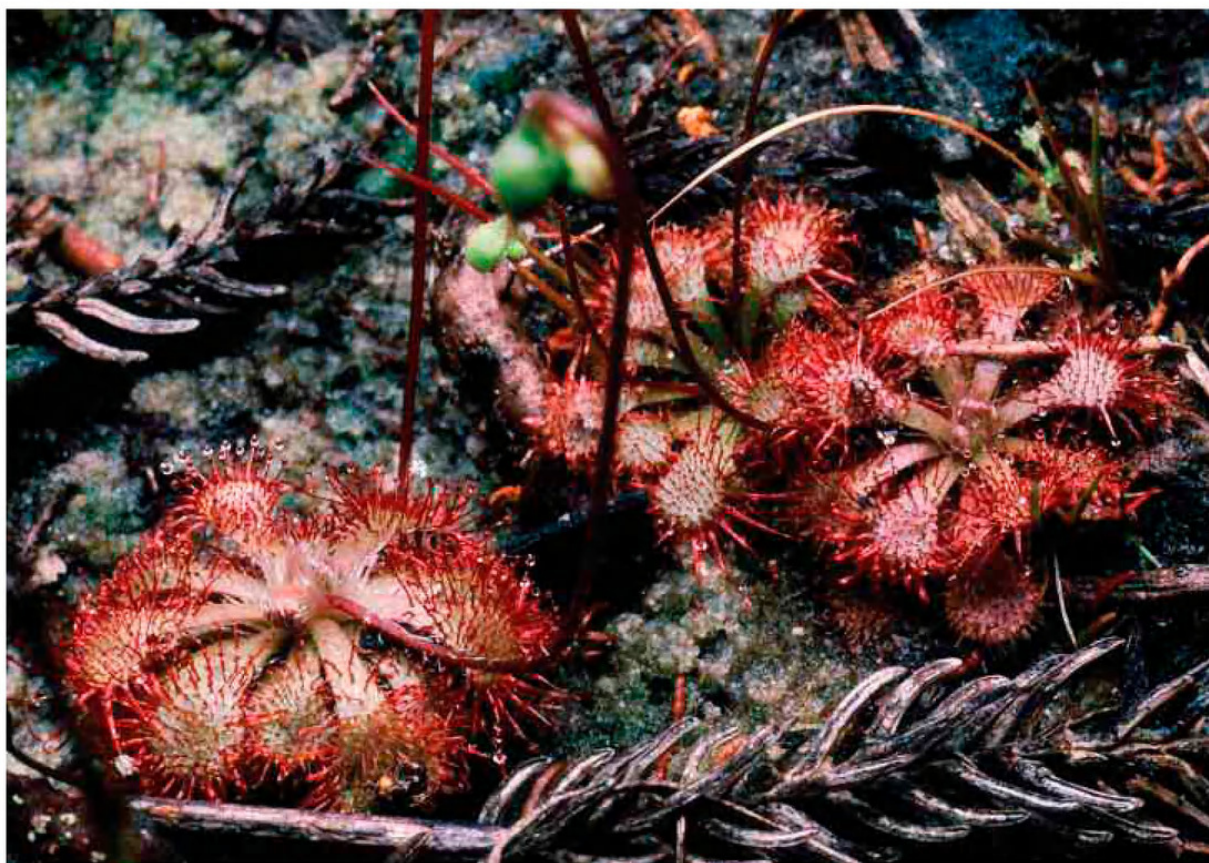
Figure 5: Plants of D. spatulata var. bakoensis growing in shaded locations have a less vividly red coloration.