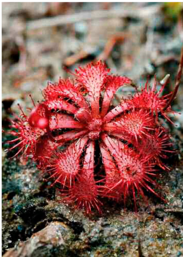
Figure 3: Close-up of a rosette of D. spatulata var. bakoensis . Note the distinctly petiolate leaves.