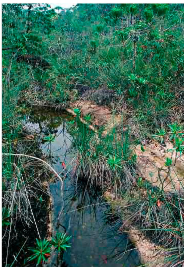
Figure 2: Typical habitat of Drosera spatulata var. bakoensis in Bako National Park.

Some populations of D. spatulata found in New Zealand have a leaf shape similar to D. spatulata var. bakoensis . This is especially true for the "alpine form" (Salmon 2001), i.e., the plants described as D. triflora Colenso (Colenso 1890), which are similar to D. spatulata var. bakoensis in terms of size and number of flowers). However, the differences between the two sets of plants are as follows (New Zealand plants in parentheses): the base of the inflorescence scape is glabrous (lower 1/4 of the scape covered by simple white hairs), slightly glandular pedicels and upper third of the scape (pedicels and upper third of the scape glabrous), petals pale pink (petals white), and the stigmatic tips cylindrical and smooth to minutely papillate (clavate and papillate). The New Zealand populations of D. spatulata need further investigation and may deserve a distinct taxonomic classification.