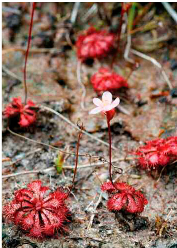
Figure 4: Group of D. spatulata var. bakoensis in Bako National Park, Sarawak, Borneo.