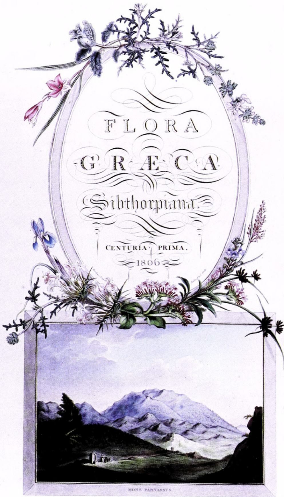
Figure 1: Frontispiece to Flora Graeca , vol.1 (London 1806); a coloured engraving based on a drawing by Ferdinand Bauer (altered at the suggestion of J.E. Smith). The plants arranged around an oval are (in a clockwise direction) — top: Gladiolus triphyllus , Salvia pomifera , Salvia lanigera ; — bottom: Panicum teneriffae , Veronica gentianoides , Cyperus fuscus , Fedia cornucopiae , Morina persica , Salvia lanigera , Gynandris sisyrinchium . Within the oval (left down) the title written by [N.] Tomkin [Scripsit] and (right down) the signum of the engraver Halliwell & Co [Sculp] (cf. Lack 1997:625,627).