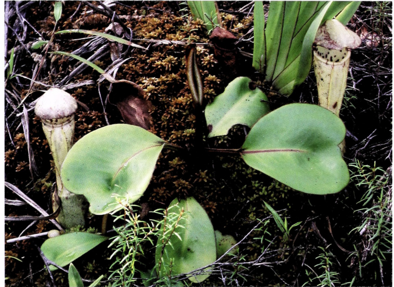
Figure 1: Young Nepenthes clipeata in Sphagnum , the typical growth habit for smaller plants. Notice the unique nature of the tendril attachment to the leaves. Image provided to the ICPS for use by the Nc SP, courtesy of Chien Lee.