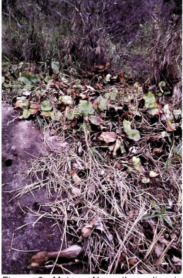
Figure 3: Mature Nepenthes clipeata plants damaged by collectors. Image provided to the ICPS for use by the NcSP , courtesy of Chien Lee.