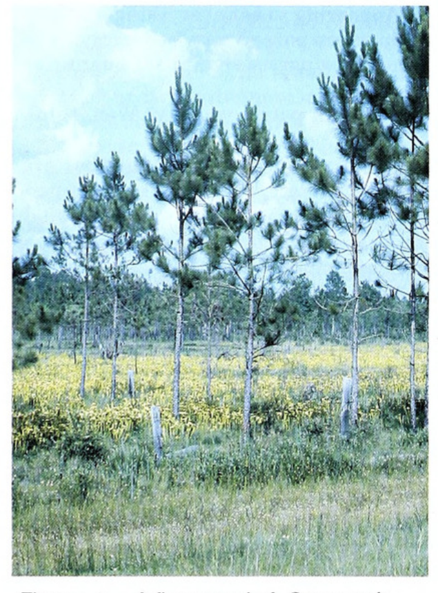
Figure 1— A fine stand of Sarracenia flava in a seep slope pasture alongside a back road in Toombs County, Georgia.

He tried mowing them in various seasons with a similar result. Initially, of course, he had let his cattle loose in them, but the sarracenias flourished, and he felt they were