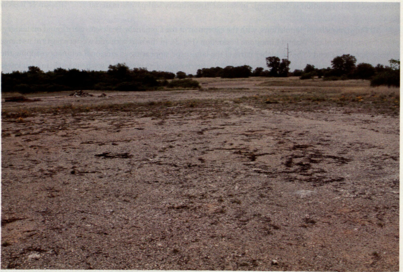
FIG. 3. Typical Dalea reverchonii habitat, Rocky Walnut Limestone glade with thin soil over exposed bedrock. Photo taken 24 Apr 2011, Utley site, Parker County, Texas.

cedar glades as D. reverchonii does in the Walnut Limestone glades. Both species in Series Purpureae thrive in shallow soil and cracks in exposed limestone bedrock (Barneby 1977). Baskin and Baskin (1988) suggest that marginal populations of widespread species, through catastrophic selection, “could result in narrow edaphic endemics...[and] may have played a role in the evolution of some of the rock outcrop endemic taxa, especially those that are closely related to widely distributed taxa within their geographic region.” Both D. gattereri and D. reverchonii are on the margins of the geographic range of the closely related D. purpurea Vent. Catastrophic selection in marginal D. purpurea populations may have resulted in the evolution of both limestone glade endemic taxa.