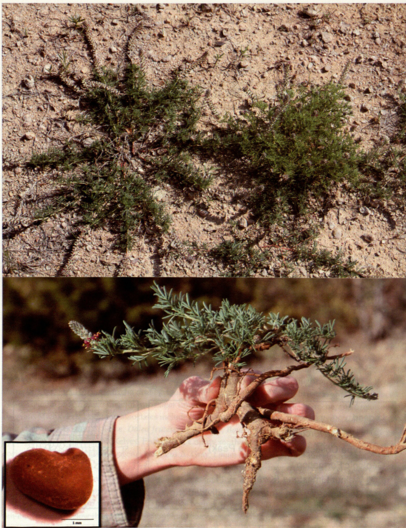
FIG. 2. Top – Dalea reverchonii plants showing prostrate habit of older plants (left) and more erect habit of younger growth (right). Photo taken 7 May 2011, New Highland Rd. site, Parker County. Bottom – Dalea reverchonii plant showing woody taproot and seeds (inset). Seeds have a hard coat and are 1.7 \times 2.7 mm. Photo taken 11 Nov 2011, Summit Ridge glade site, Parker County.