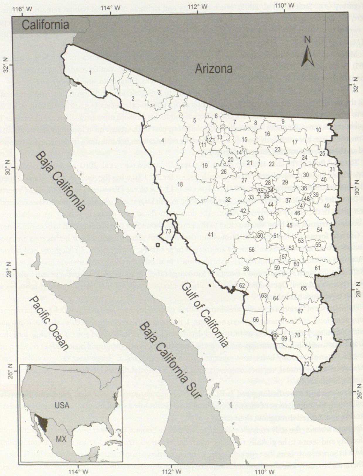
FIG. 1. Sonora showing the 72 municipios and Isla Tiburón (73). Drafted by Pedro P. Garcillán, based on the digital map of states and municipios of Mexico by Instituto Nacional de Estadística y Geografía (INEGI), www.inegi.org.mx (2012).